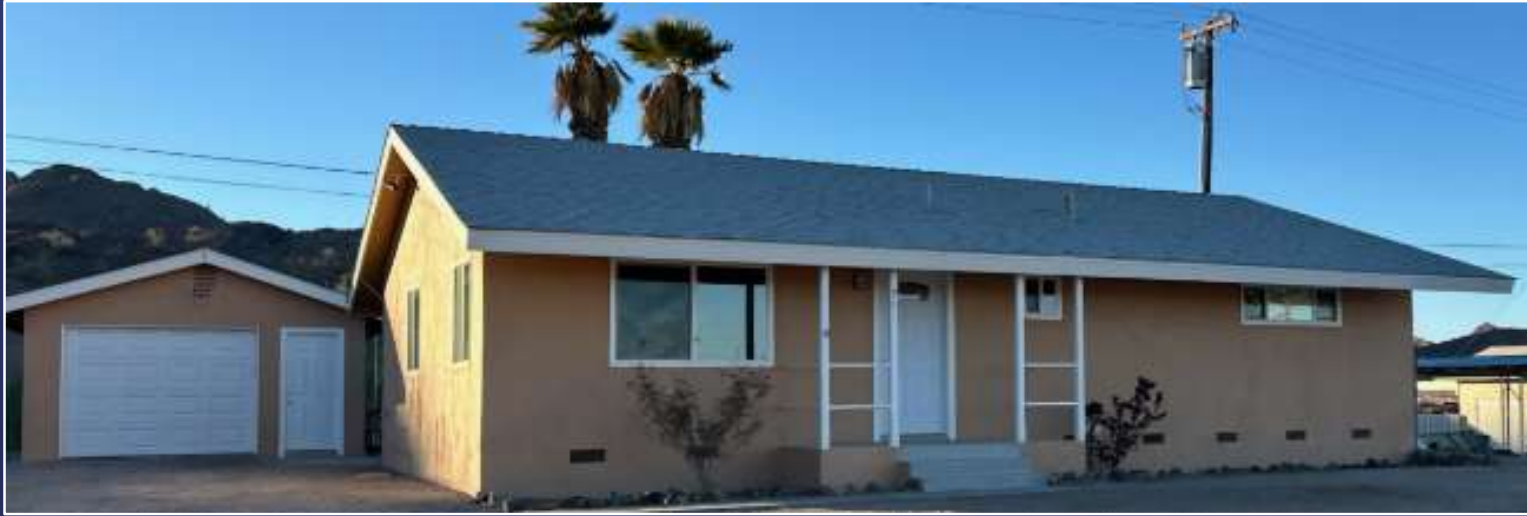
Exterior Paint and Windows