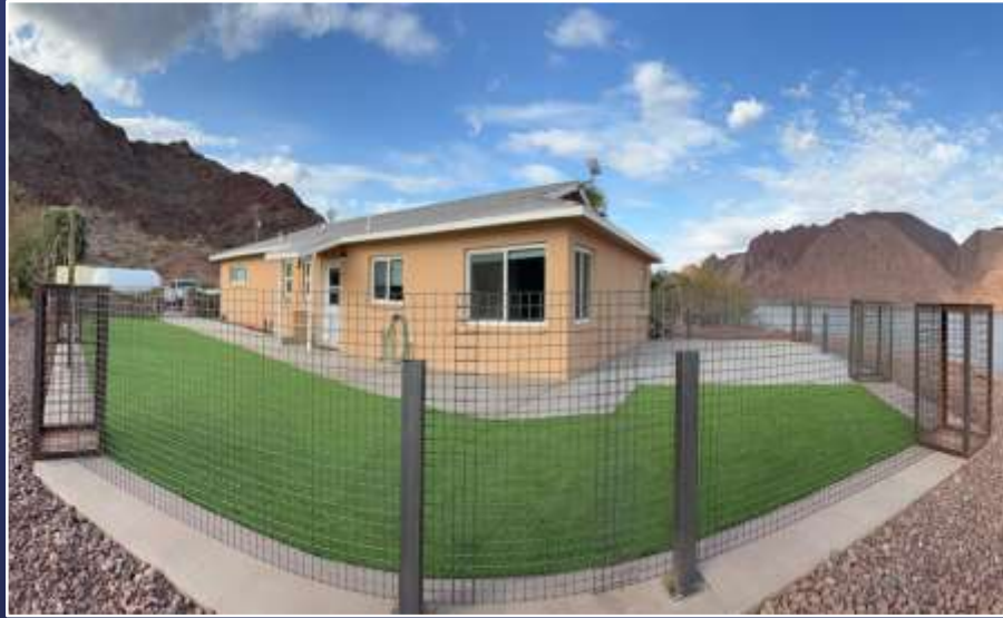
Copper Basin House Yard