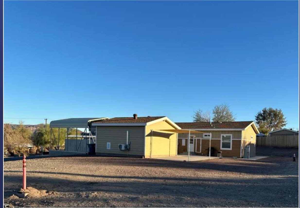
Perimeter Fencing w/Privacy Slats (68 houses)