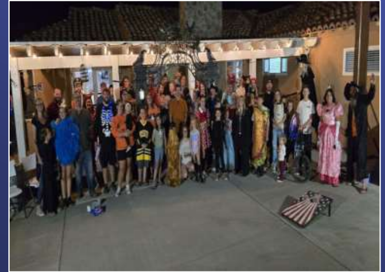
Gene Community Center