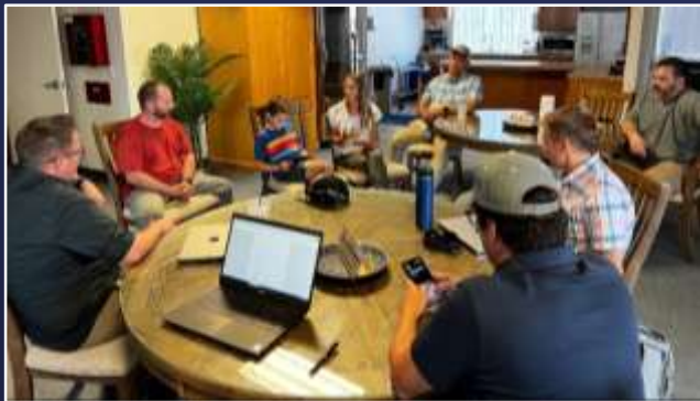
Resident Feedback Session

Near-term improvements began September 2022