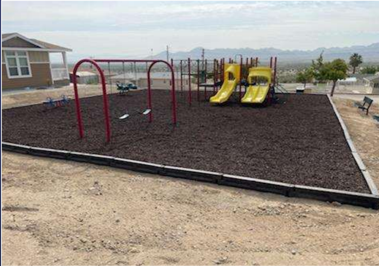
Playground Shade Structure and Fencing (Hinds Village, Eagle Mtn., Iron Mtn.)