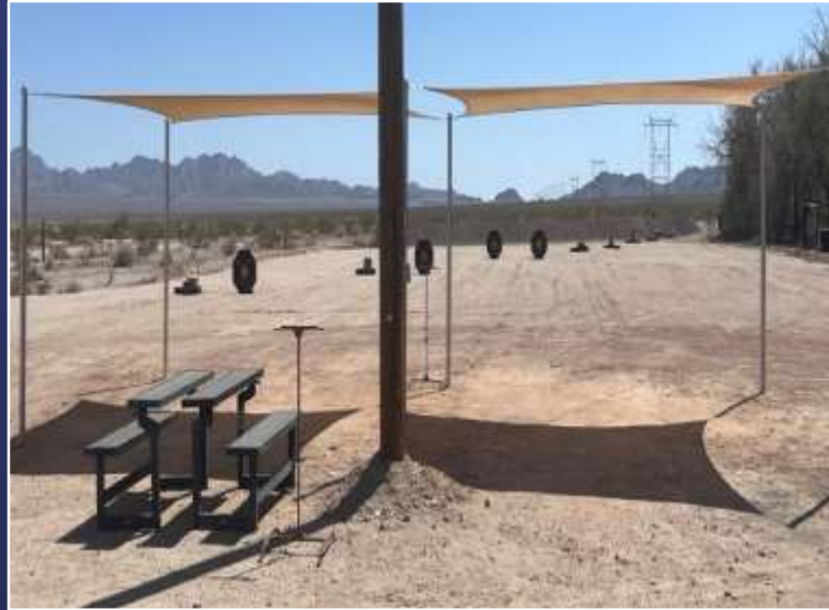
Archery Range Shade Structures