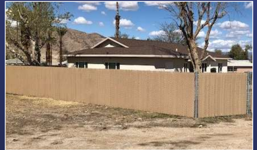
Perimeter Fencing with Privacy Slats