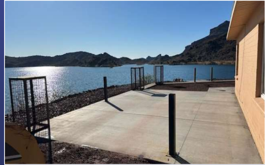
Copper Basin House Patio