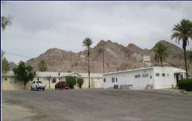
Iron Mtn. Lodge & Kitchen