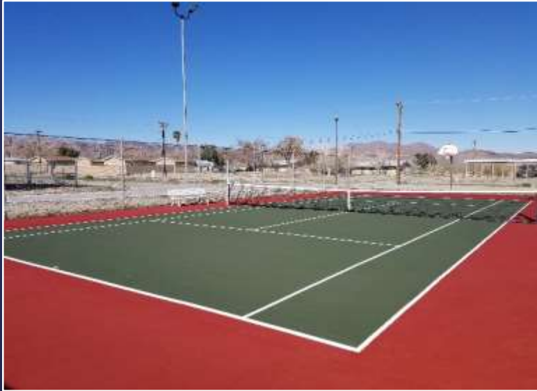
Resurfaced Sports Courts