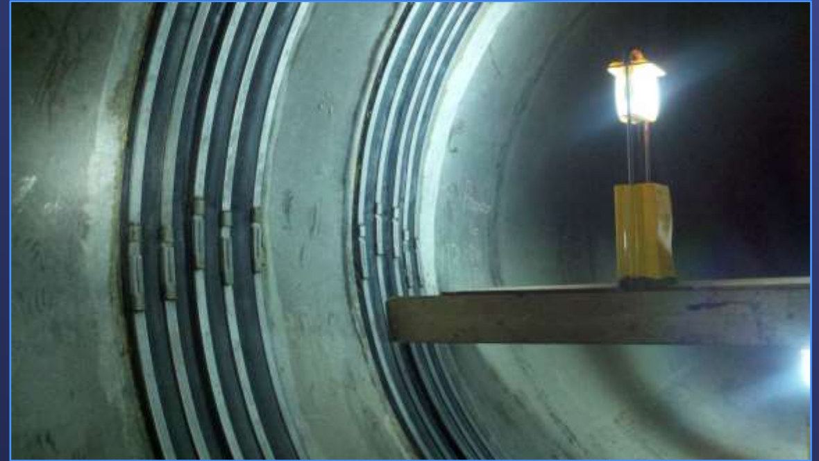
Previously Installed Seals