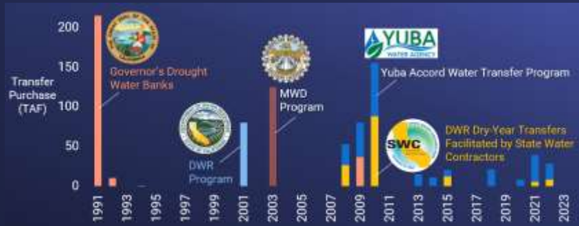
Slide 6 Item 6B OW&S Committee August 19, 2024

Exploring new partnerships and approaches to water transfer arrangements