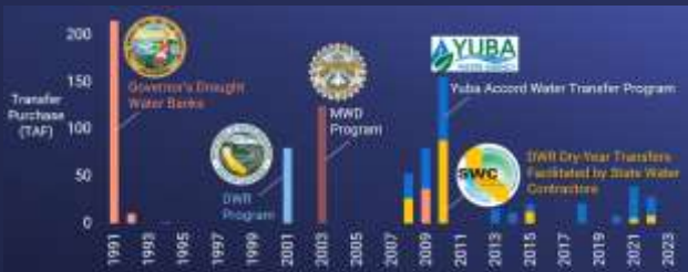
Slide 6 Item 6B OW&S Committee August 19, 2024