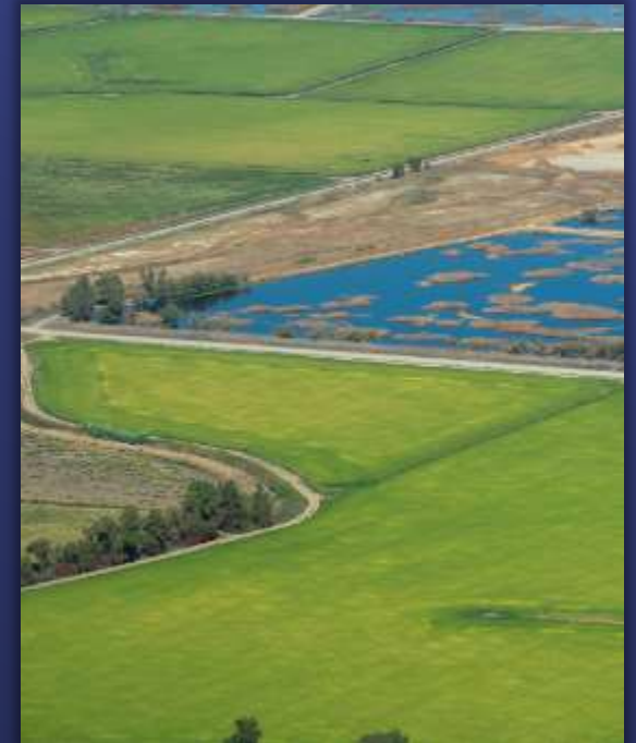
Rice fields in northern CA