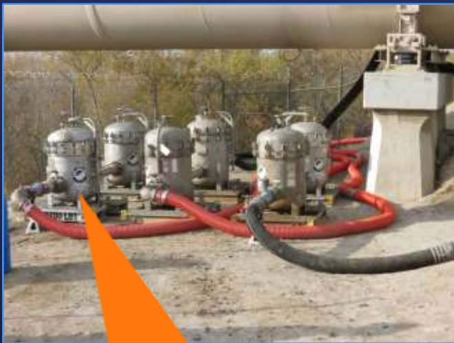
Quagga Filters for Dewatering