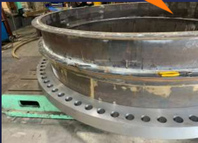
New Slip Joint Fabrication @ La Verne Shops