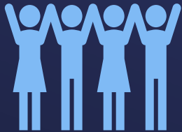
Diversity & Inclusion