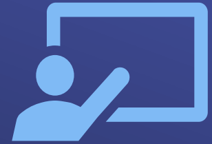
Training & Skill Development