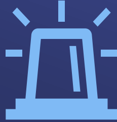
Mission Critical Occupations