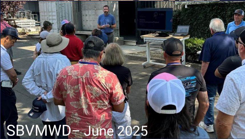
SBVMWD – June 2025