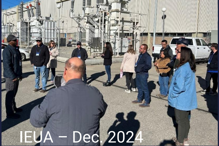
IEUA – Dec. 2024