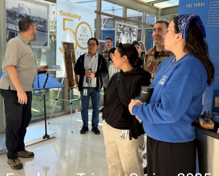
Employee Trips – Spring 2025