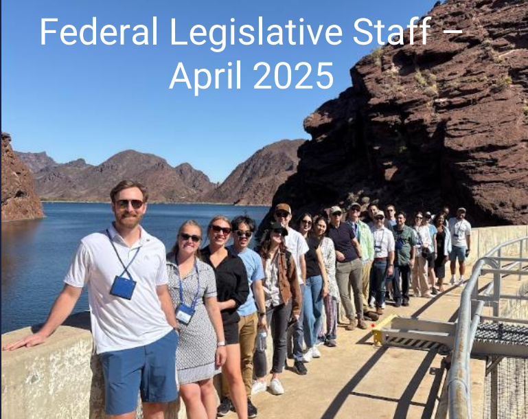
Federal Legislative Staff – April 2025