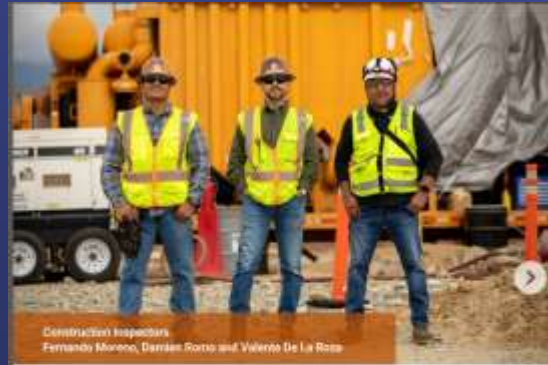
Water Champions Etiwanda Pipeline Project