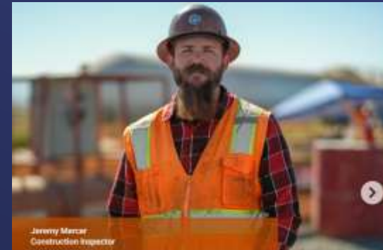
Water Champions Perris Valley Pipeline