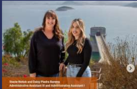
Water Champions Business Support for Construction Services Unit