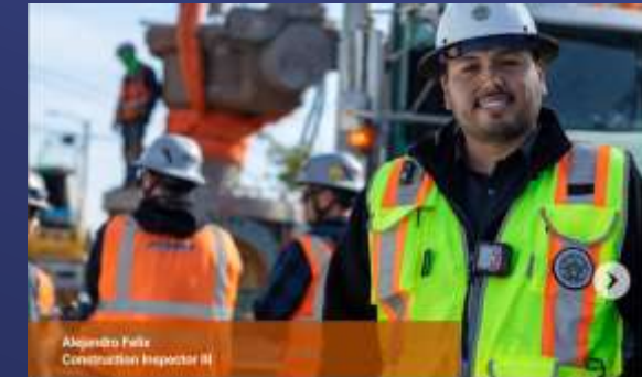
Water Champions Second Lower Feeder Pipeline Rehabilitation