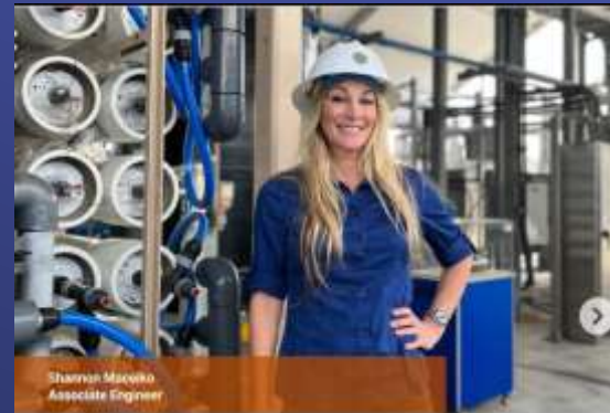
Water Champions Pure Water Southern California