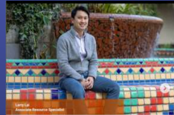
Water Champions State Water Project Water Supply