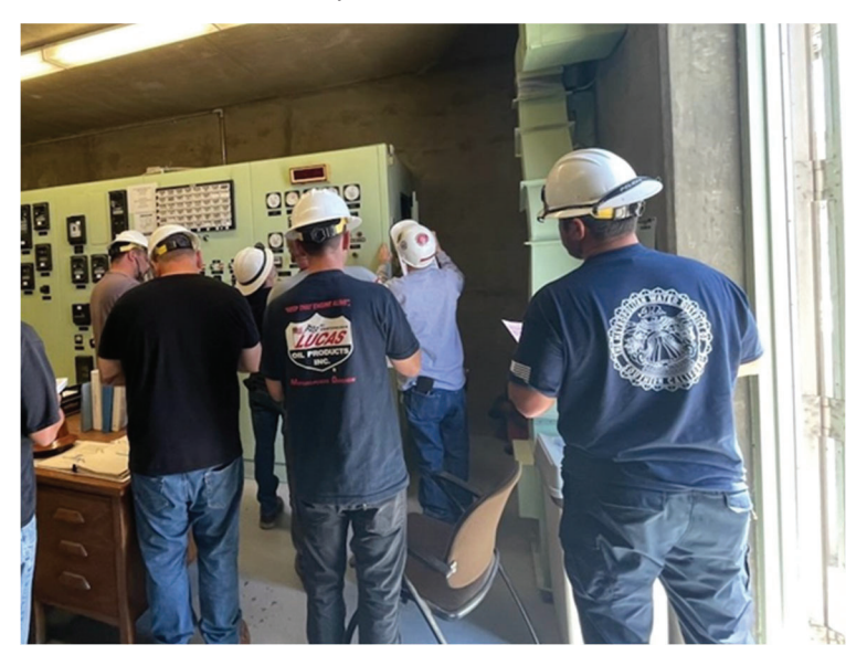
OSO training exercise to jack the unit at Lake Mathews HEP during pre-start procedures (left) and to perform a weekly inspection procedure at Temescal HEP (right)