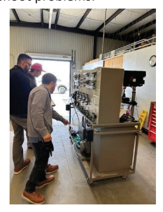
Mechanical apprentices reviewing hydraulic systems

Lastly, the Class of 2026 electricians and desert electrical cross-training participants also completed their final exams this month. They were tested on troubleshooting circuits and motor control devices. The final exam consisted of written and practical components, allowing instructors to assess each student's competency and ability to troubleshoot problems.