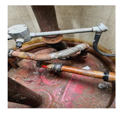
Vent line capped below grade