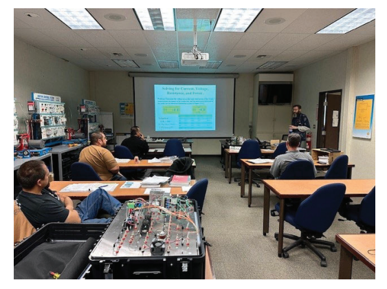
Electrical apprentices learning to calculate current, voltage, resistance, and power