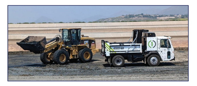
Battle Motors electric dump truck to transport sludge at Mills Plant

In accordance with Metropolitan's "try before you buy" approach in implementing the CARB Advanced Clean Fleet regulation, an all-electric dump truck demonstration was conducted at the Mills facility. Feedback was positive for handling onsite activities. The truck generated less sound and greater torque than traditional dump trucks, but greater range would be required for remote or off-site work. Staff will continue to arrange additional opportunities to test available zero emission vehicles.