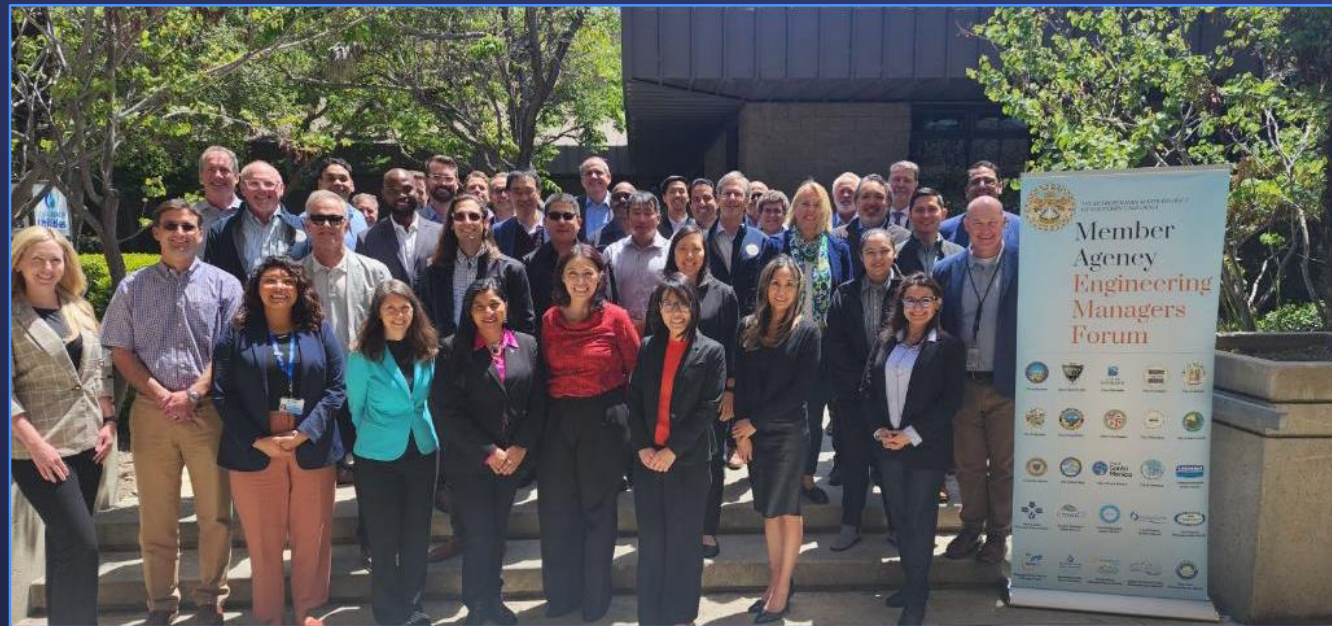
Member Agency Engineering Managers Forum