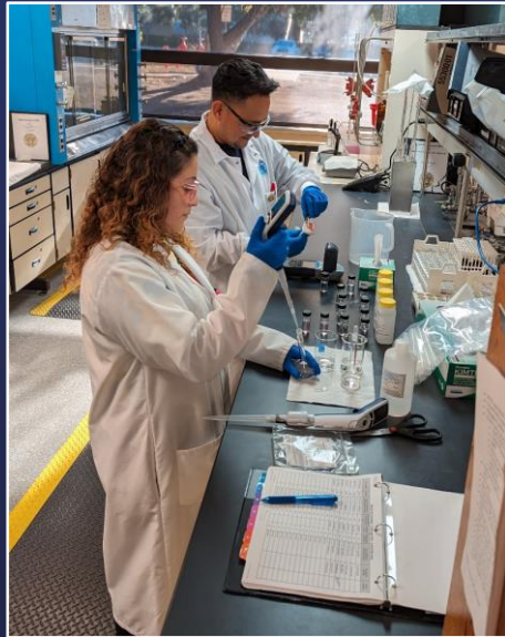
Nitrite Analysis at Metropolitan's Water Quality Lab