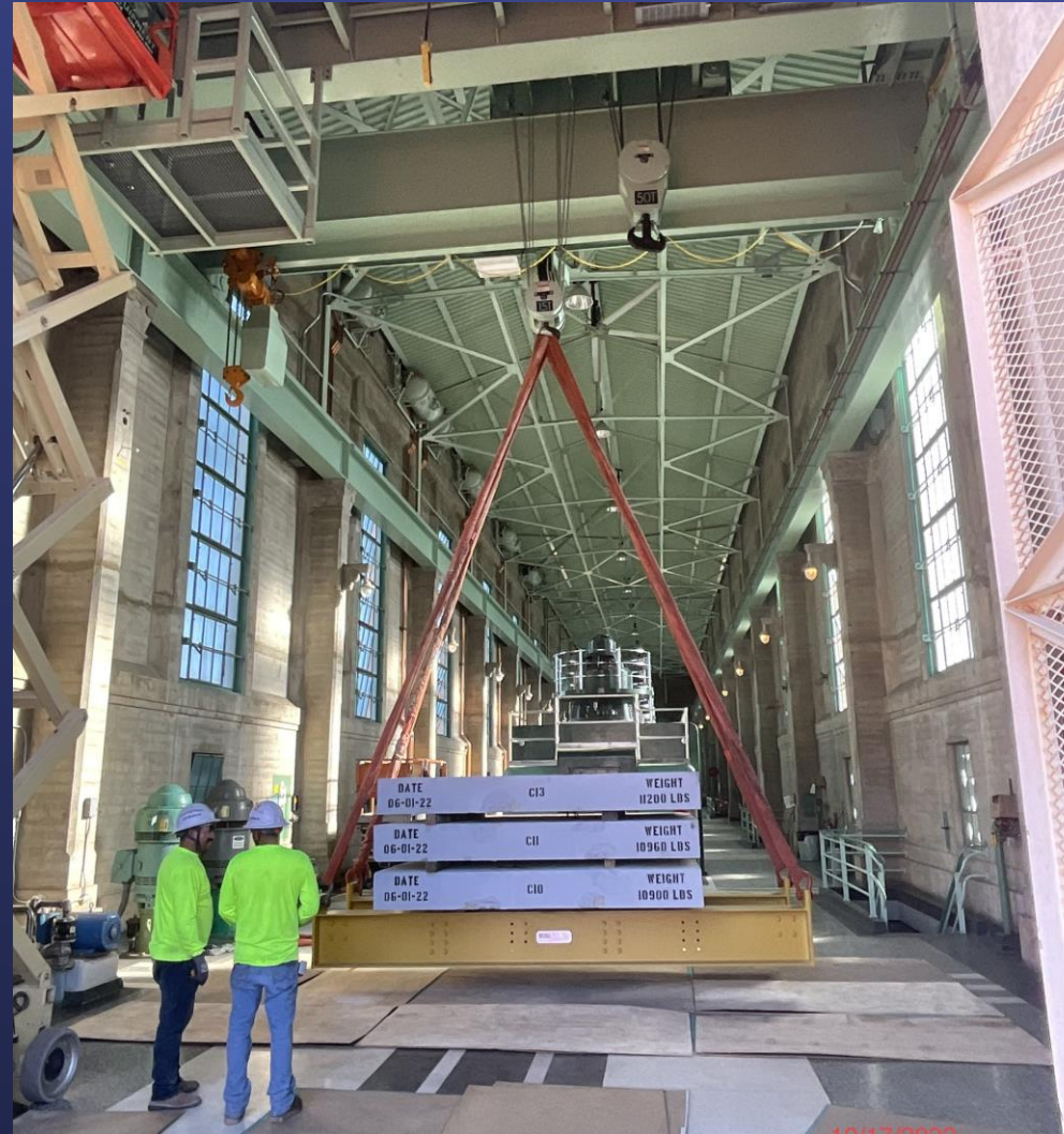
Load Testing New Crane at Gene Pumping Plant