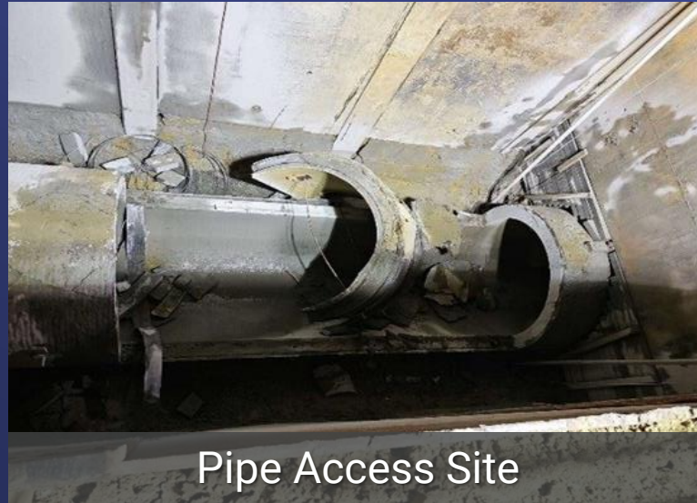
Pipe Access Site