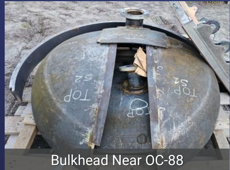
Bulkhead Near OC-88