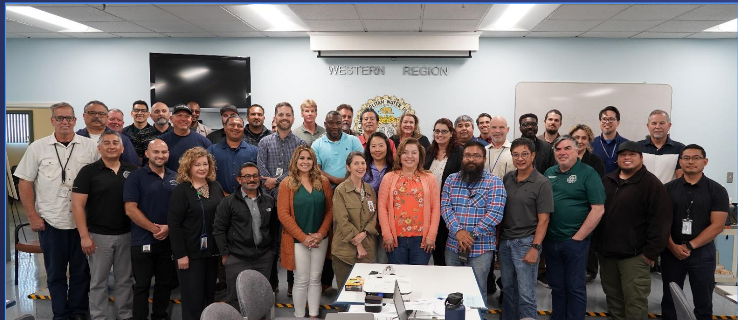
Engineering & Operations Partnering—Western Region Workshop