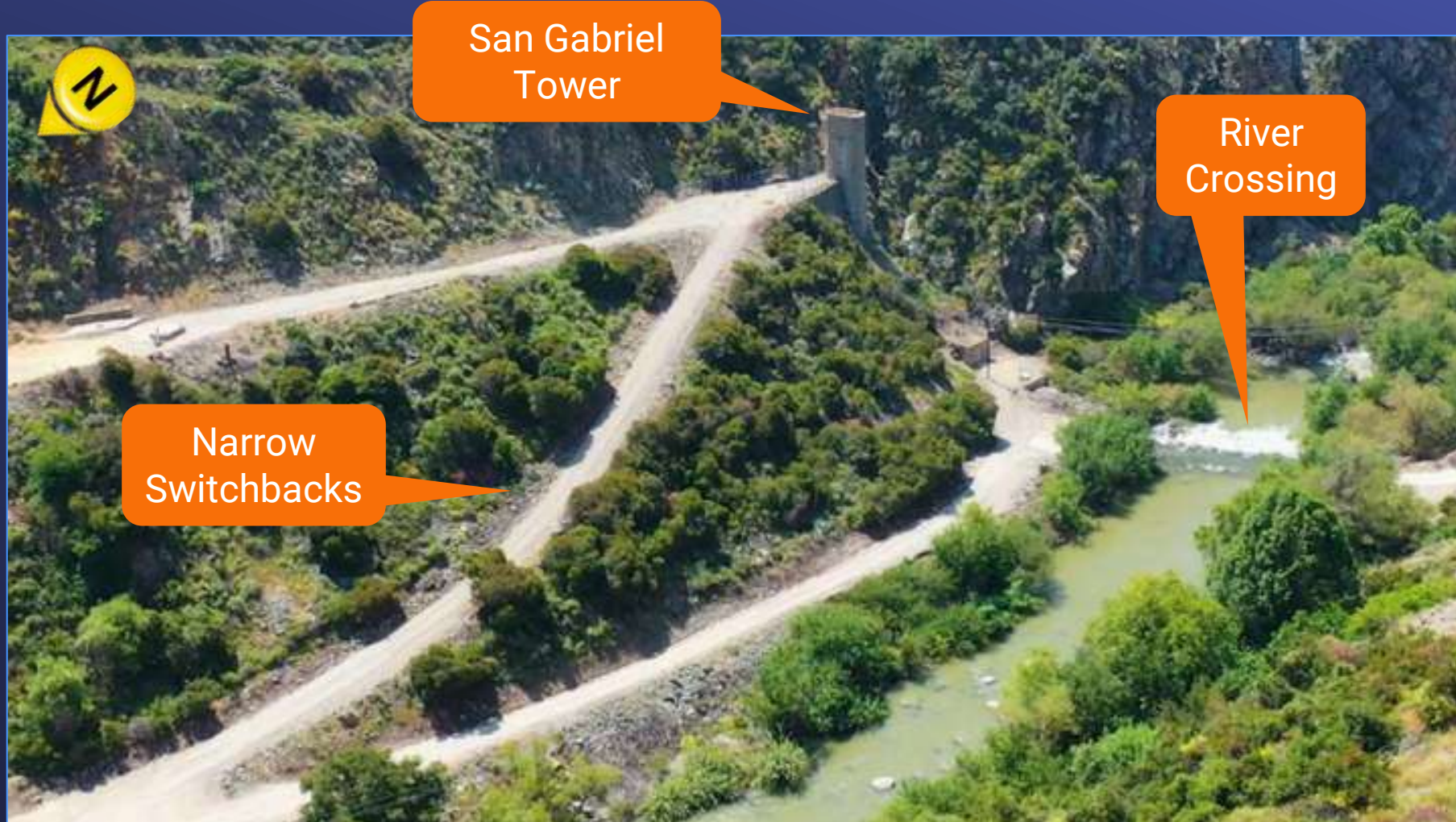
San Gabriel Tower Site Access