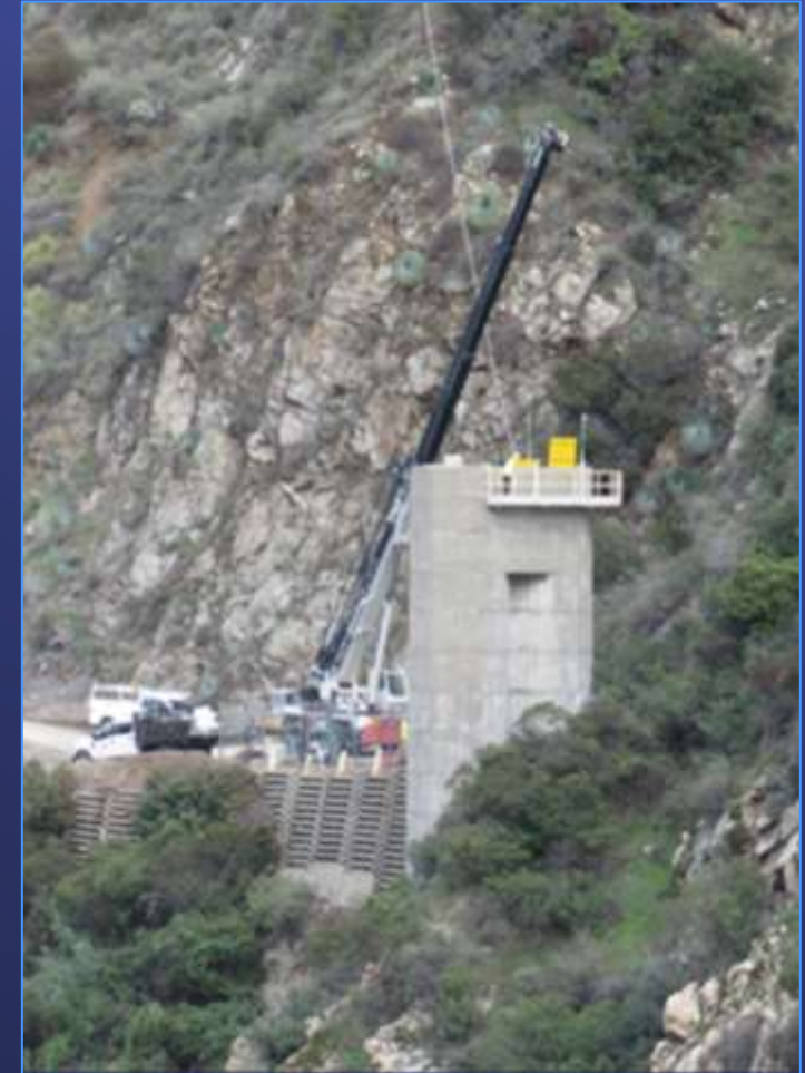
San Gabriel Tower