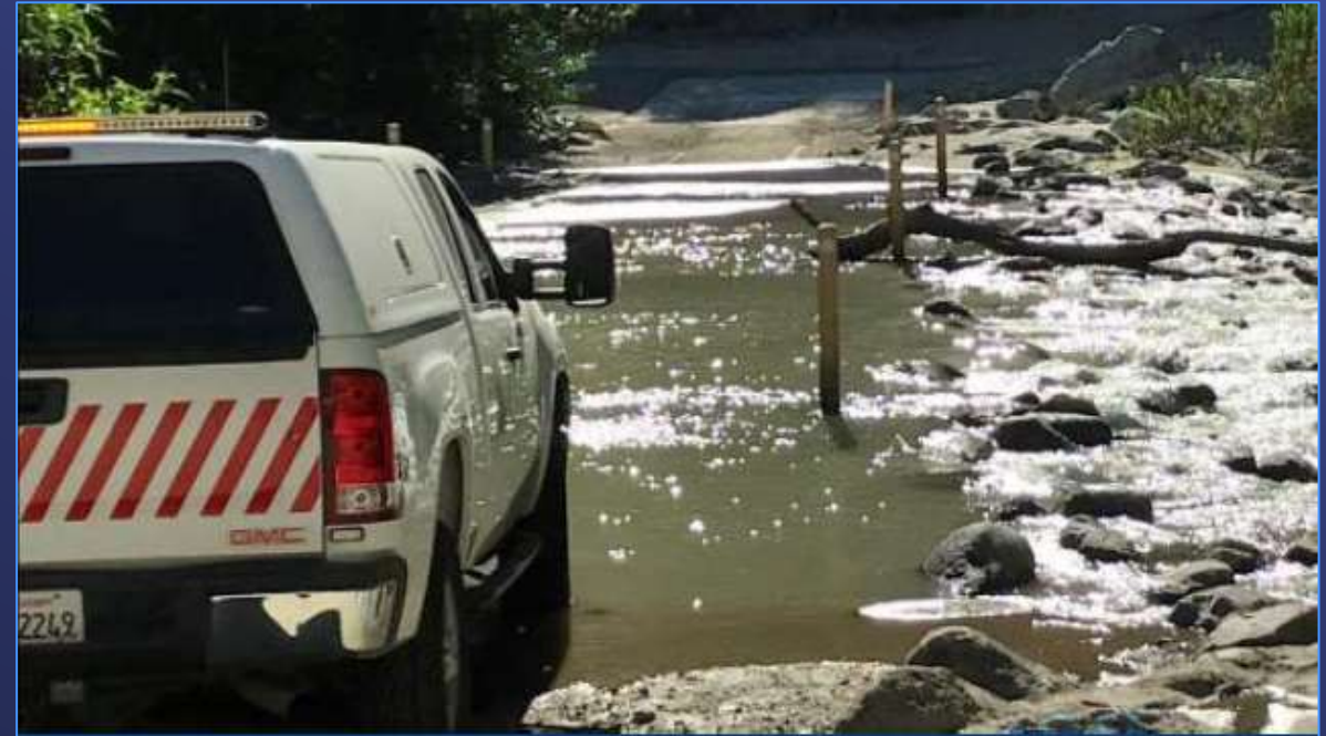
San Gabriel River Crossing