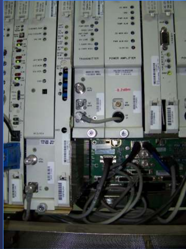
Microwave Radio Equipment