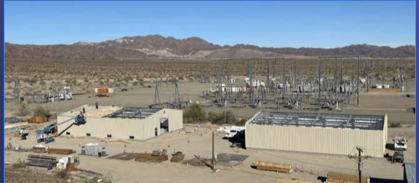
Eagle Mountain Buildings