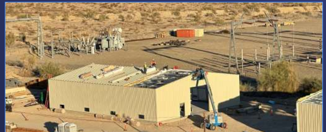
Insulation & Roof Installation – Eagle Mtn. Storage Bldg.