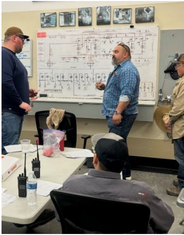
Desert staff rehearsing switching at the mimic board

This month, the Safety and Technical Training team conducted an observation of high-voltage switching at the Hinds Pumping Plant. The team reviewed the switching orders, observed a rehearsal using the mimic board, and closely monitored the entire switching process. This direct observation allows the training staff to develop relevant training materials and better prepare for upcoming Desert System Operating Orders Manual training sessions. Additionally, the team facilitated a meeting with all training coordinators, during which they provided valuable instructions on generating reports, assessing training needs, and enrolling employees in training.