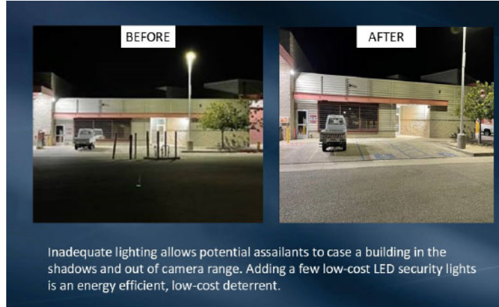
WaterISAC publishes a detailed case study on Metropolitan's low-cost/no-cost physical security mitigation measures