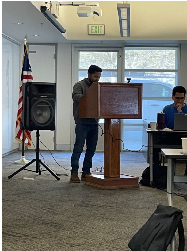
Apprenticeship staff presenting during the meeting with the Department of Water Resources

Staff provided a presentation on Metropolitan's Apprenticeship Programs during Metropolitan's semi-annual meeting with the DWR. The meeting was held at the future Apprentice Training Center near Diamond Valley Lake in Hemet, California. The presentation included an overview of the delivery and management of the state-certified mechanical and electrical programs, as well as a status update on the new Apprentice Training Center.