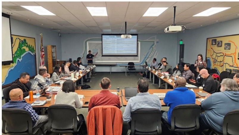
Attendees at the Seismic Resilient Water Task Force Collaborative Workshop

On March 6, the Jensen Water Treatment Plant hosted representatives from the Los Angeles Department of Water and Power, Department of Water Resources (DWR), and Metropolitan at a special workshop focusing on how the three agencies would jointly respond after a catastrophic earthquake in the Southern California area. As part of the Seismic Resilient Water Task Force, the three agencies committed to collaborate in restoring safe drinking water in the region as quickly as possible after a major earthquake. Speakers at this event included experts on the State’s Catastrophic Earthquake Response Plan and the group’s Joint Emergency Response Plan. Findings from this workshop will be used to design future collaborative exercises and plans.