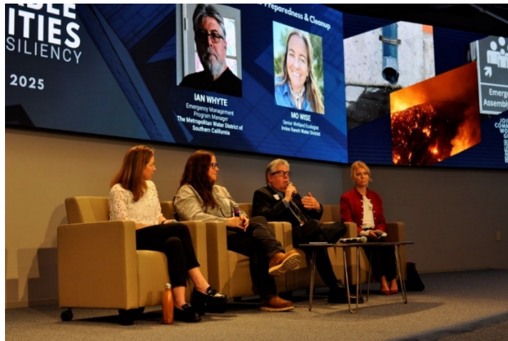
Sustainable Communities: Solutions in Resiliency Conference panel at the University of California, Irvine campus

Later that day, Metropolitan’s emergency management staff joined a panel at the Sustainable Communities: Solutions in Resiliency Conference at the University of California, Irvine. The discussion focused on lessons learned from the January 2025 wildfires in Los Angeles County and broader regional challenges, including climate readiness, housing availability, resilience to environmental disruptions, and fire safety. Emergency management’s participation reinforced Metropolitan’s role as a regional leader in emergency management and strengthened ties with state and local agencies working toward shared resiliency goals.