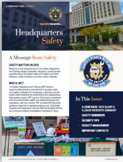
US Headquarters Newsletter

Additionally, the 2025 “Talk Safety with Me” Toolbox Topic book has been published and distributed to work teams. The book contains 52 toolbox topics—one for each week of the year—reflecting Metropolitan’s current Environmental, Health, and Safety policies and procedures. Weekly toolboxes are conducted to consistently communicate potential safety hazards, review job plans, reinforce safe work practices, and encourage open communication about safety concerns.