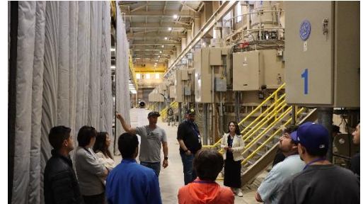
Employee CRA Inspection Trip

Provided construction-related support to residents impacted by the Rialto Pipeline/Glendora Tunnel/La Verne Pipeline shutdown (May 1) and community in Culver City for repairs to WB-34 (May 14)