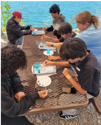
Students learning at DVL

Concluded the last DVL and Water Journeys field trips of the school year, using digital tools and water quality science experiments.