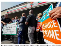
La Proposición 36, aprobada el pasado noviembre, endurece el castigo para los ladrones que reinciden en el delito.

El Grupo de Trabajo contra Delitos Minoristas del Con-