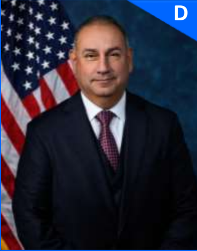
Gil Cisneros (D-31) Grace Napolitano (D)