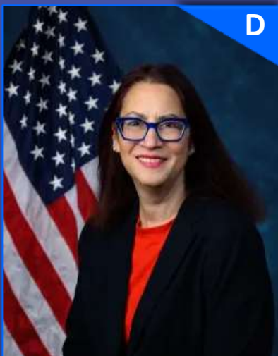
Laura Friedman (D-30) Adam Schiff (D)