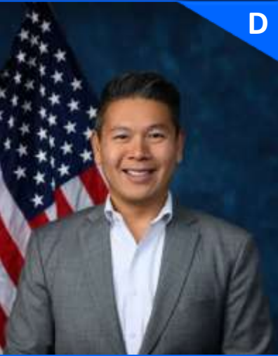
Derek Tran (D-45) FLIP – Michelle Steele (R)