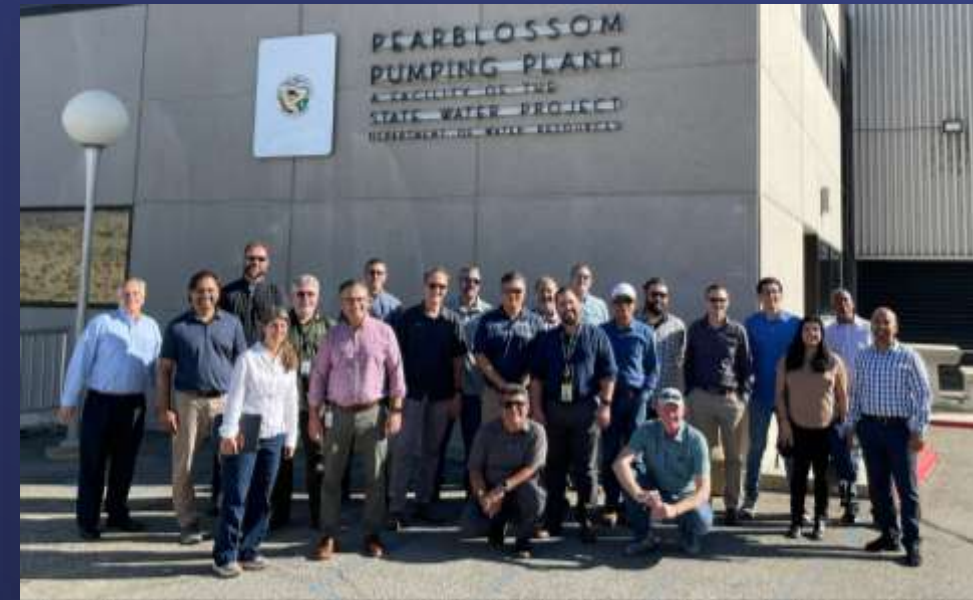
Tour of Pearblossom Pumping Plant