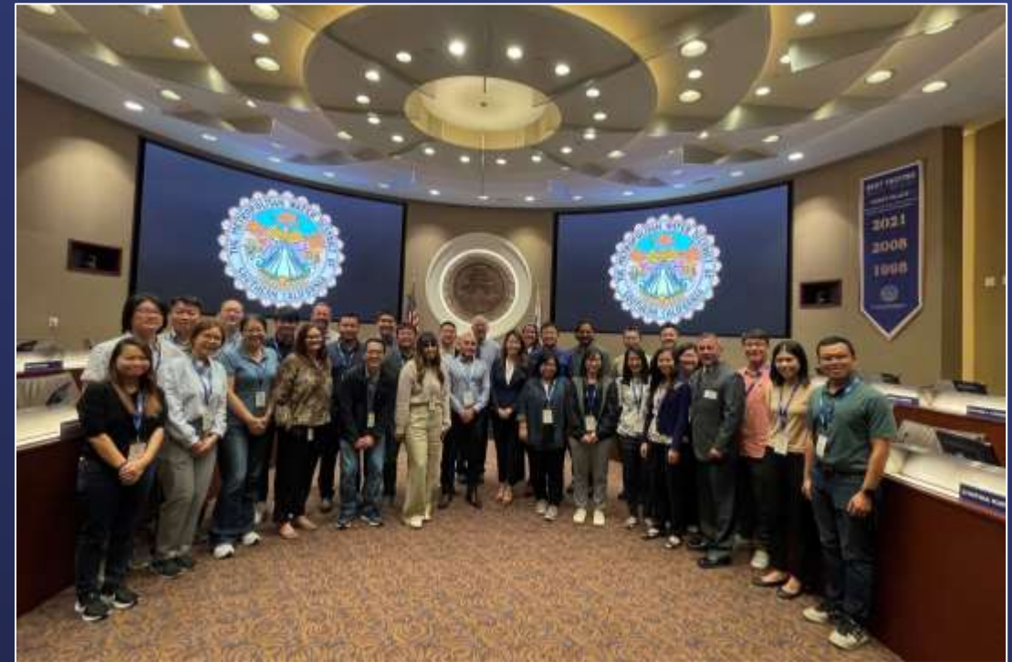
Singapore PUB Visit