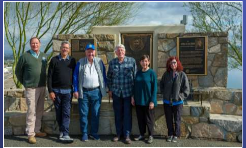
2023 EO&T Field Inspection Trip – Lake Mathews