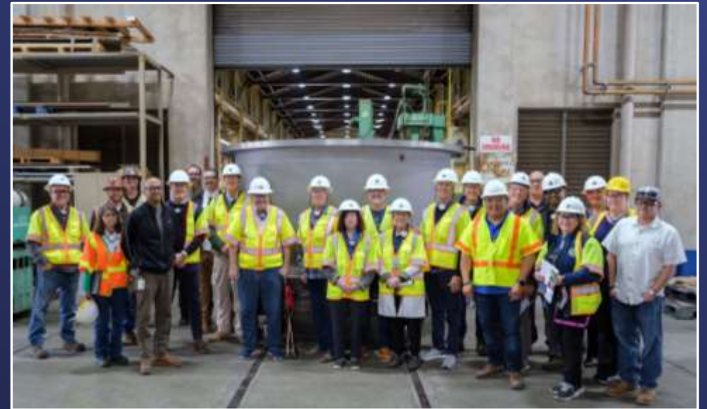
2023 EO&T Field Inspection Trip – La Verne Shops