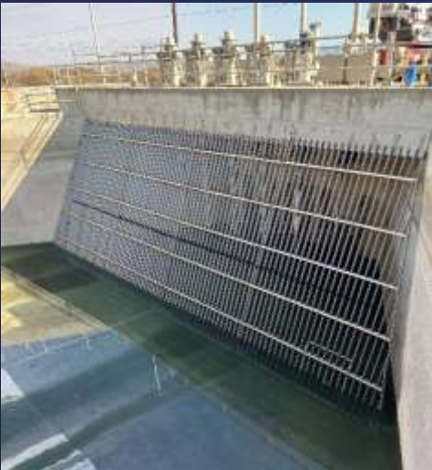
New Trash Rack East Lake Skinner Bypass