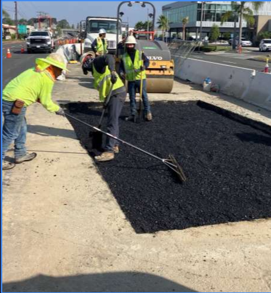
Street Restoration in Costa Mesa