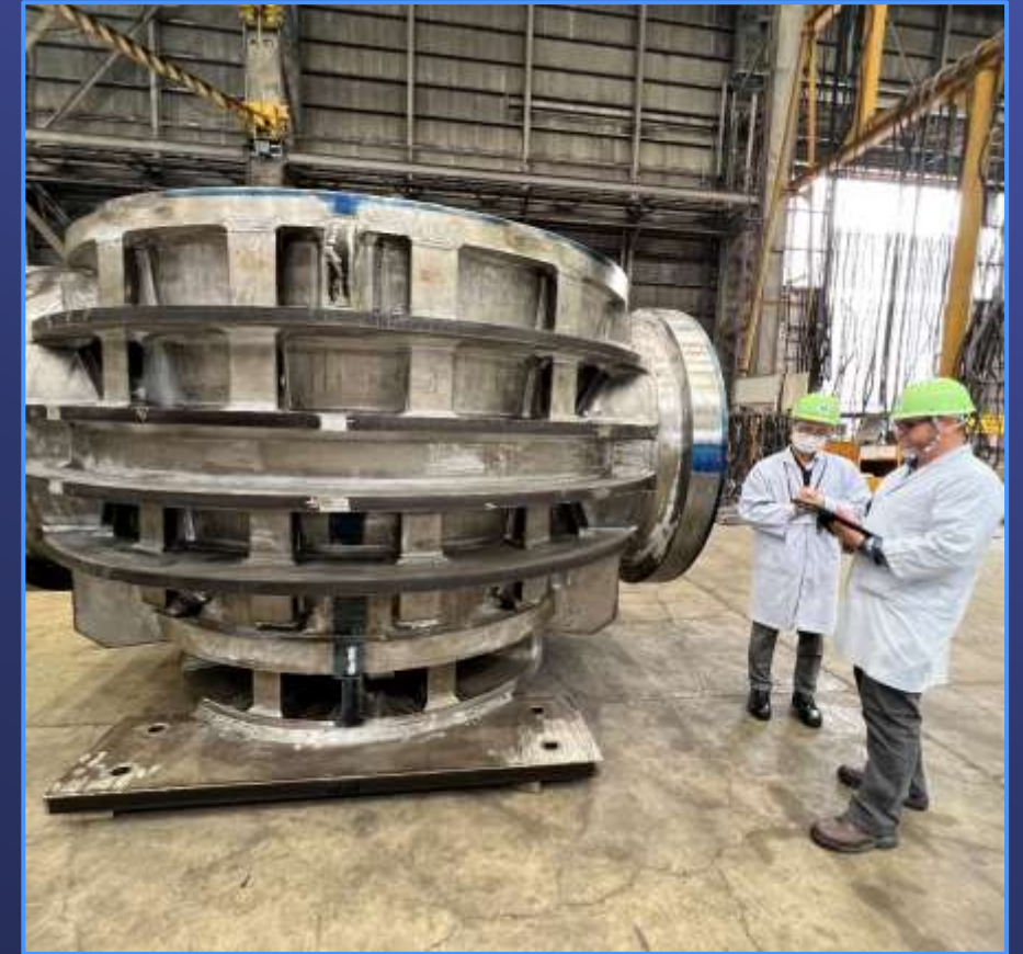
54-inch Diameter Valve Inspection (Japan)