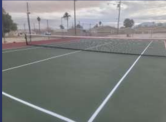
Resurfaced Sports Courts

Near-Term Improvements Began September 2022