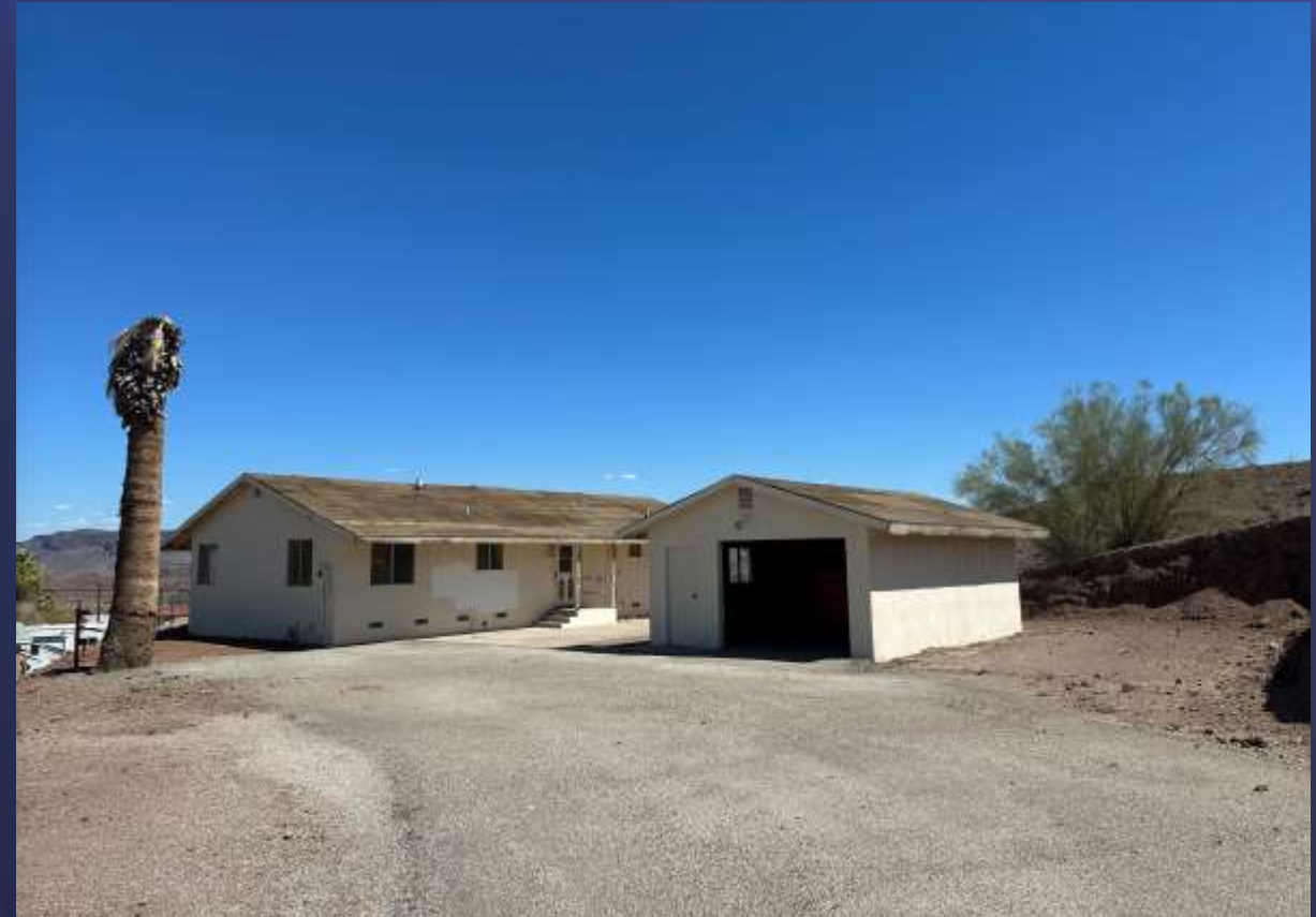
Abatement & demolition of eight houses deemed surplus (O&M)