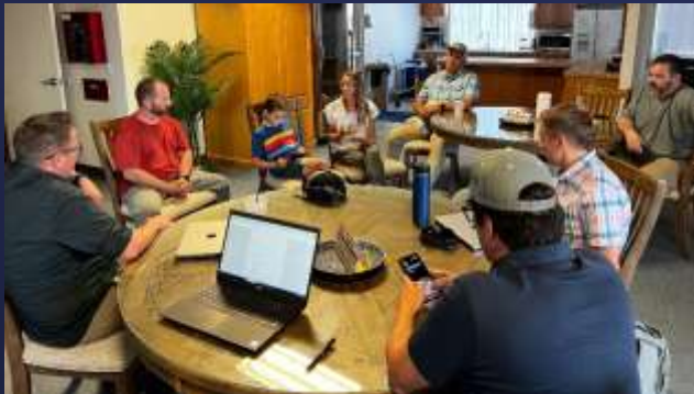
Resident Feedback Session

Urgent improvements began September 2022