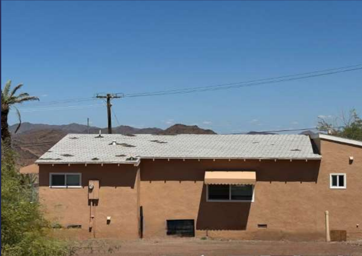
Abatement & roof replacement for 14 houses at four residential villages (CIP)