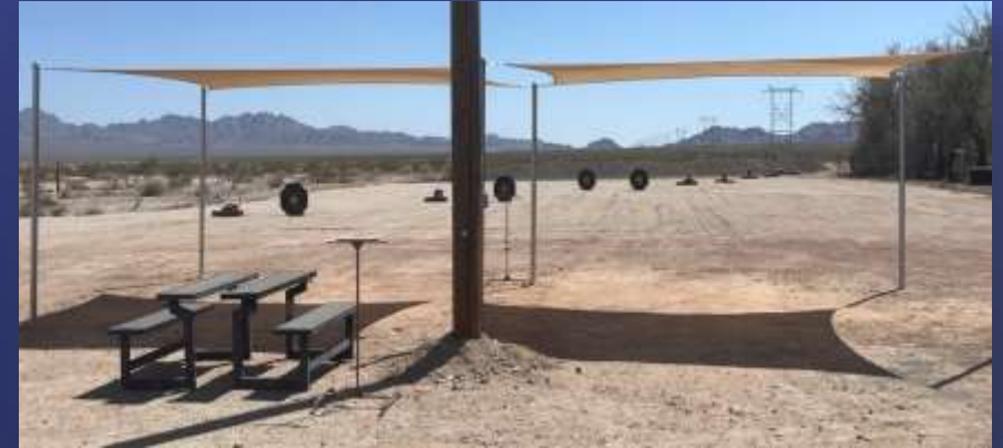
Archery Range w/Shade Structures