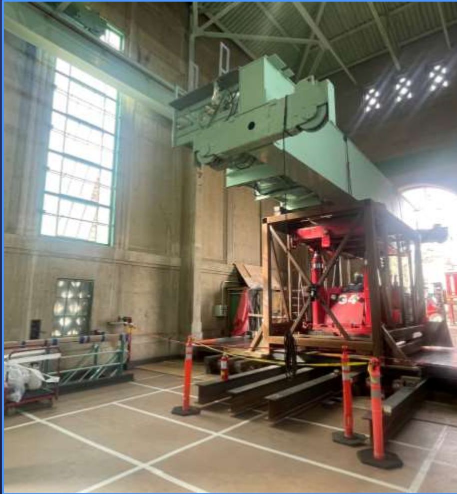
Installing the overhead crane girder at Eagle Mountain Pumping Plant