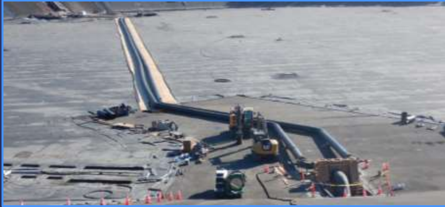
Completed 28-inch HDPE bypass at Palos Verdes Reservoir