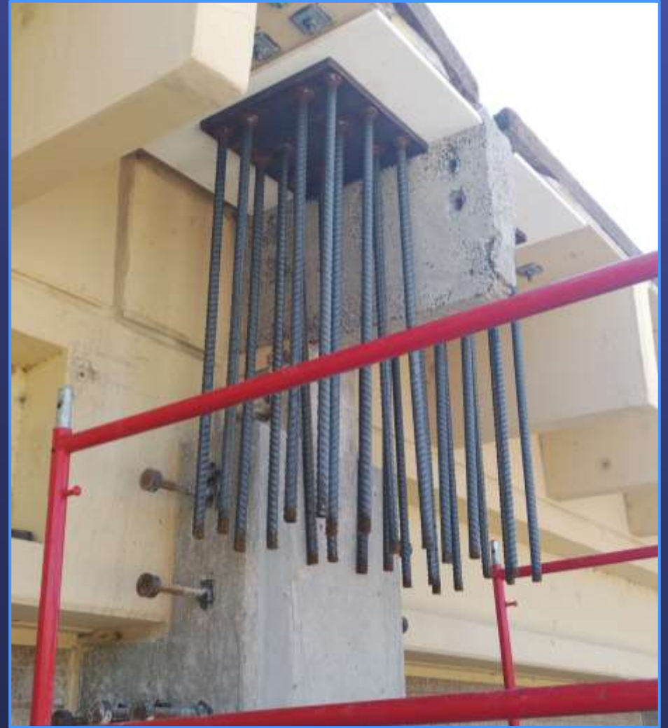
Installation of Rebars and Post-Tensioning Bars for Seismic Reinforcement of the Columns