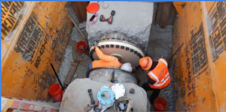
Bolt Up of 42-inch Blind Flange