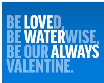
February social media posts

Featured posts to celebrate the Super Bowl, Black History month, Lunar New Year, and Valentines Day.