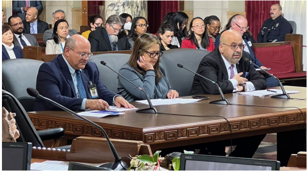
GM Hagekhalil testifying at LA City Council Energy and Environment Committee meeting

GM Hagekhalil spoke at the Los Angeles City Council's Energy & Environment Committee about Metropolitan's efforts to develop regional water supplies in collaboration with the Los Angeles Department of Water and Power and Los Angeles County Sanitation District. (February 23)