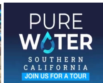
Metropolitan's Pure Water Southern California tours provide the public with a greater understanding of how recycled water will help meet our region's future water needs