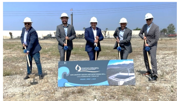
Groundbreaking ceremony at Inland Empire Utilities Agency

Metropolitan attended the Inland Empire Utilities Agency’s exploratory boring and monitoring wells groundbreaking ceremony. The project will provide data to advance local efforts to produce and store more purified recycled water. (June 10)