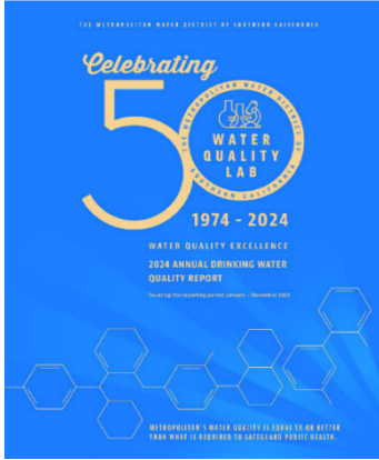
Commemorative 2024 Water Quality Report