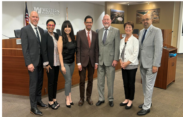
Metropolitan’s leadership continued its visits to member agencies. Shown here at Foothill Municipal Water District and Western Water.

Metropolitan sponsored and staff attended the Central City Association Annual Treasures of Los Angeles event, commemorating the organization’s 100 th anniversary. (June 5)