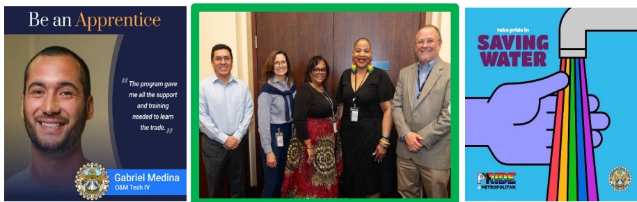
Social Media Posts for June 2024, highlighting the Apprentice Program, BEA Juneteenth celebration and Pride @Met outreach