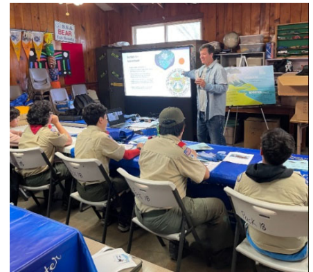
SouthgatePark Troop 468 participated in a workshop for the Boy Scouts of America Soil & Water Conservation Merit Badge. Scouts took part in a discussion and hands-on learning to complete the seven required badge elements.