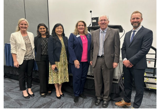
Tour of Weymouth Plant for conference attendees and group photo of Metropolitan staff at ACE24/AWWA

Treatment Plants. Staff also coordinated presentations/discussions for a World Bank delegation with officials from Burkina Faso, Ivory Coast, Lesotho, Argentina, Barbados, Brazil, Jamaica, and Paraguay, and provided a tour of Weymouth for Korean Water and Wastewater Works Association. (June 11-14)