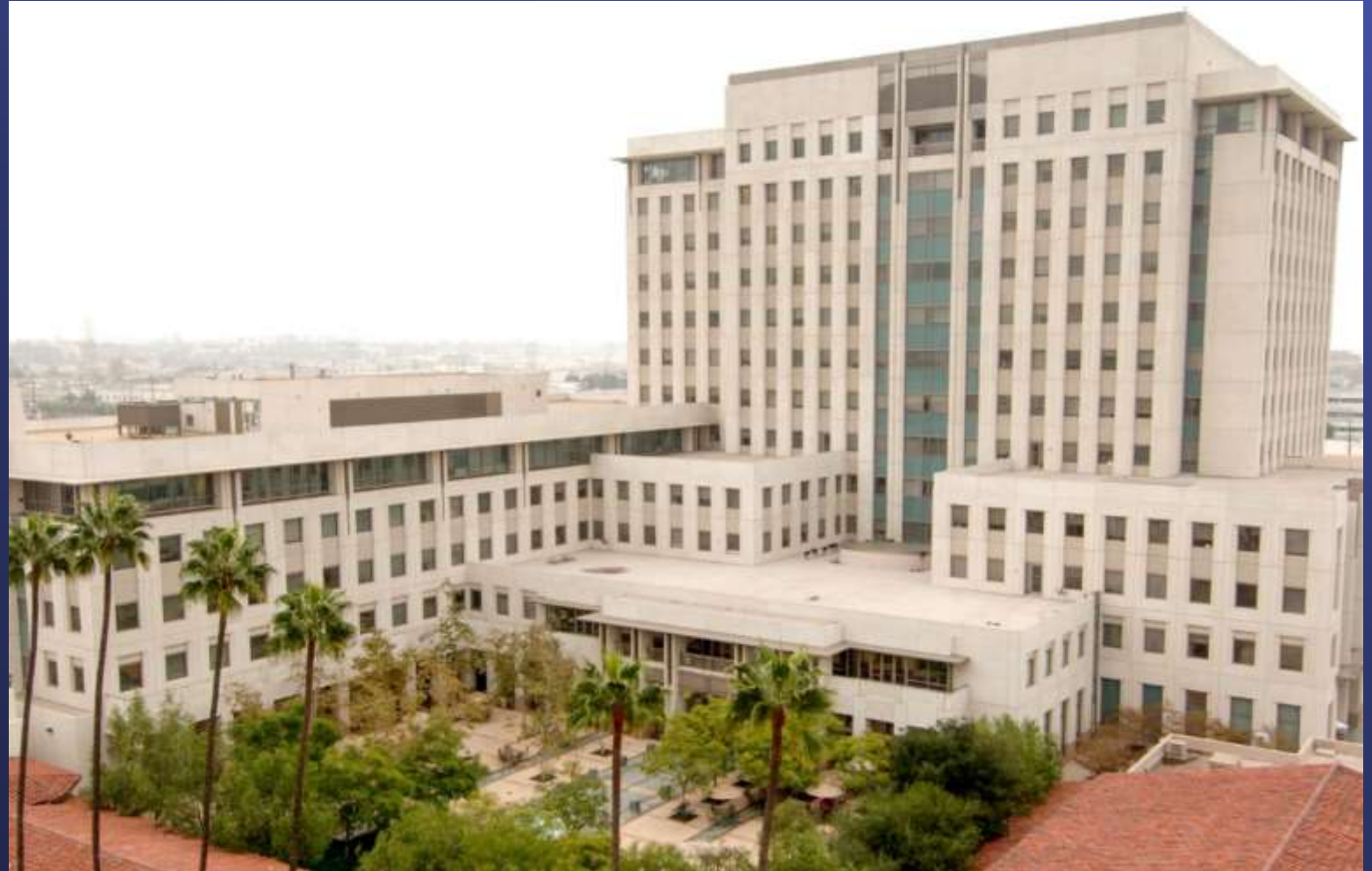
Headquarters courtyard, in foreground

Courtyard is used for lunch and internal/external events