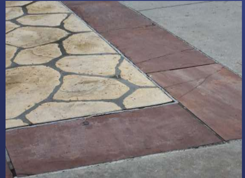
Example of damaged tiles, failed waterproofing, and trip hazard