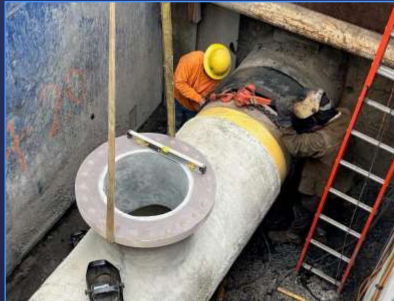
Installing Closure Piece

Engineering, Operations, & Technology Committee