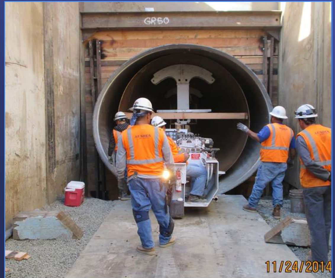
Lakeview Pipeline Stage 1 Relining Bernasconi Tunnel