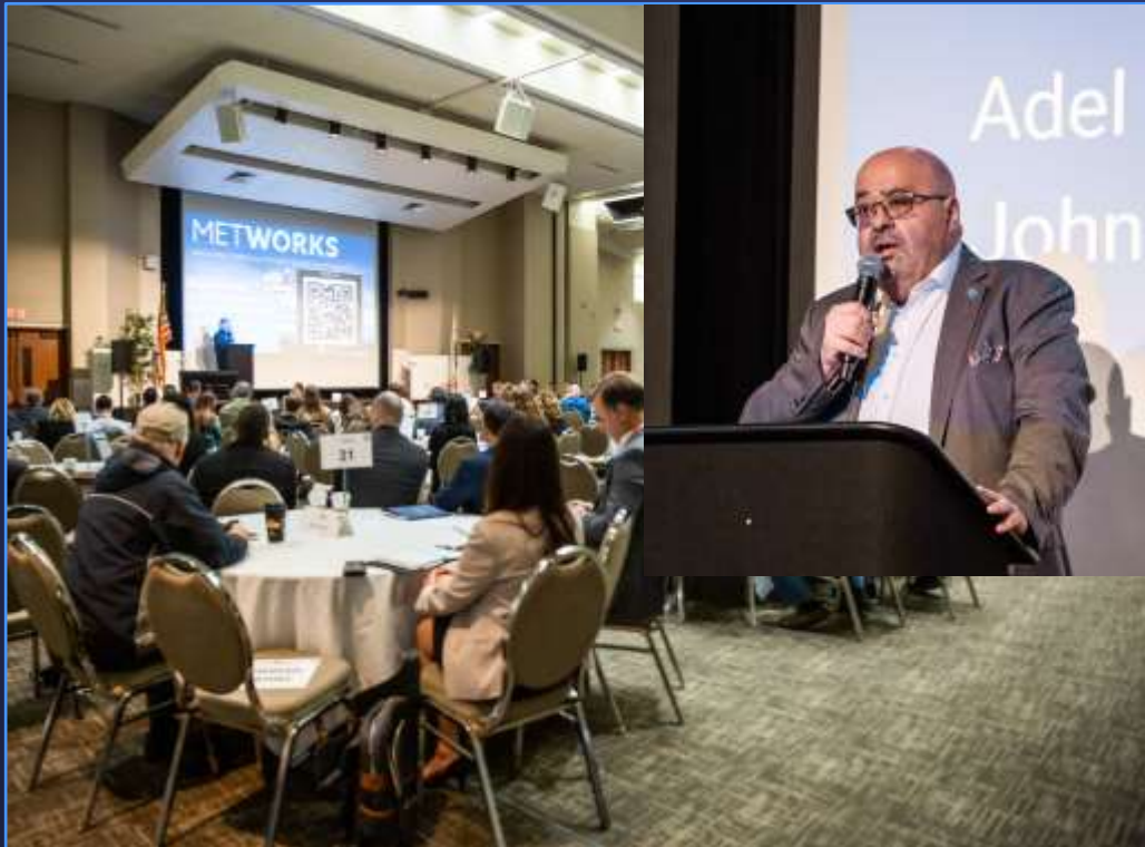
2022 Event at Carson, CA