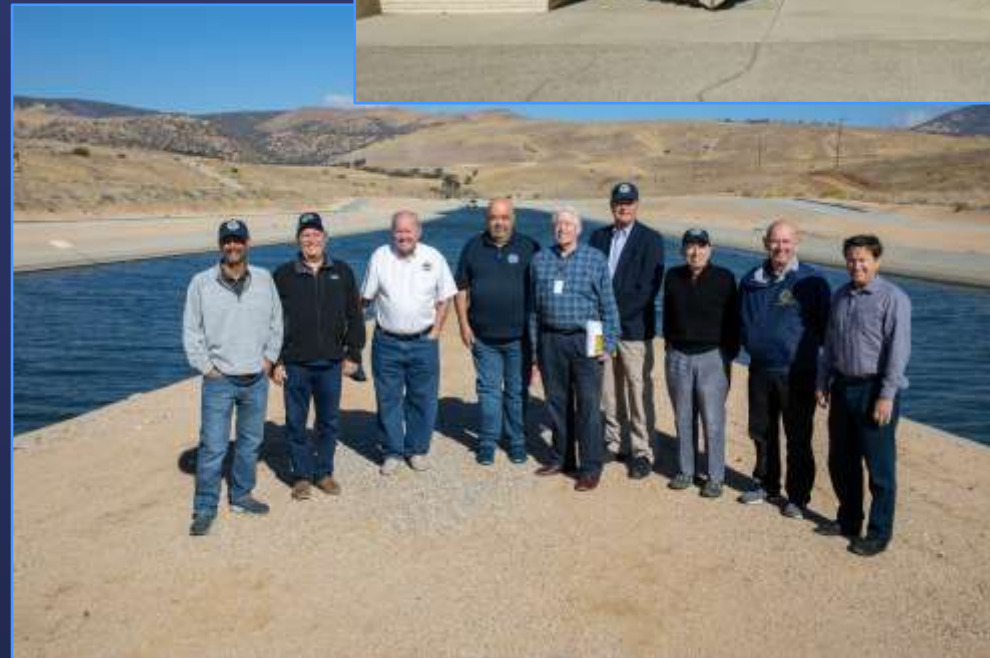
2022 Inspection Trip