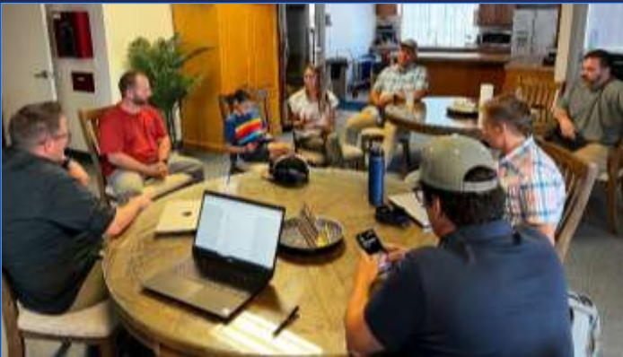
Community Planner Site Visits