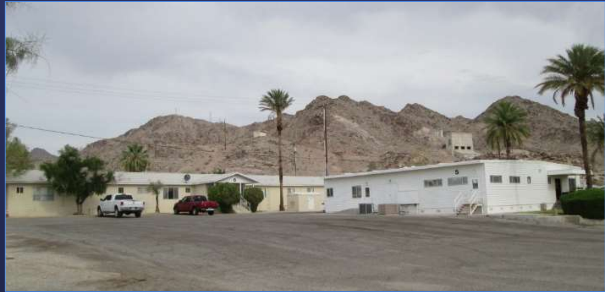
Iron Mtn. Kitchen & Lodge