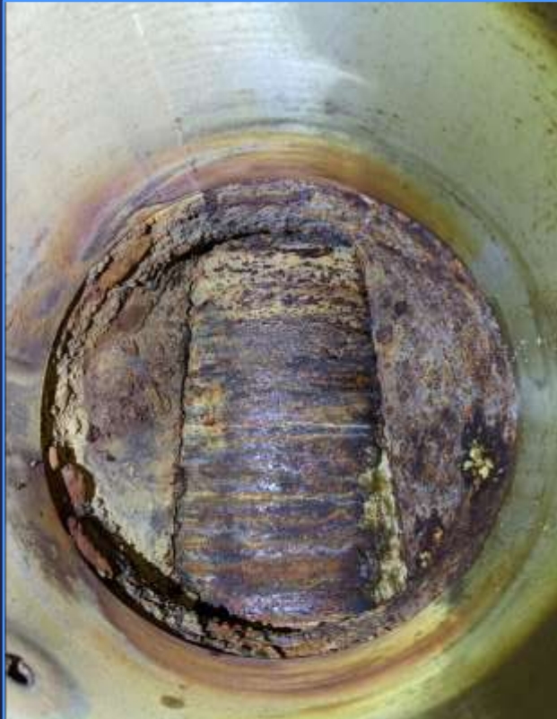
Existing Plug Valve Interior