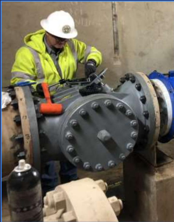
Plug Valve Installation