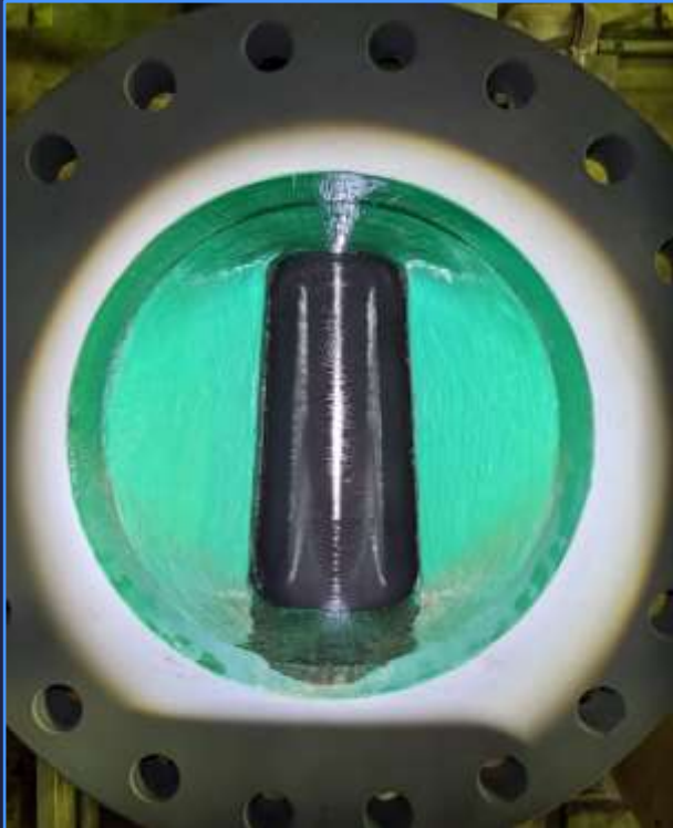
New Plug Valve Interior