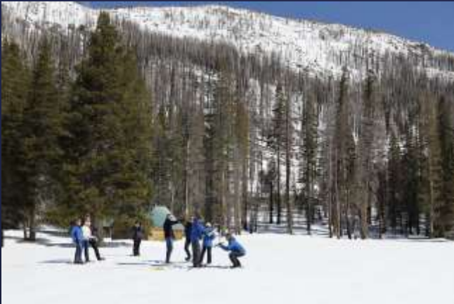
Phillips Station April 2, 2024 Snow 113% of Average