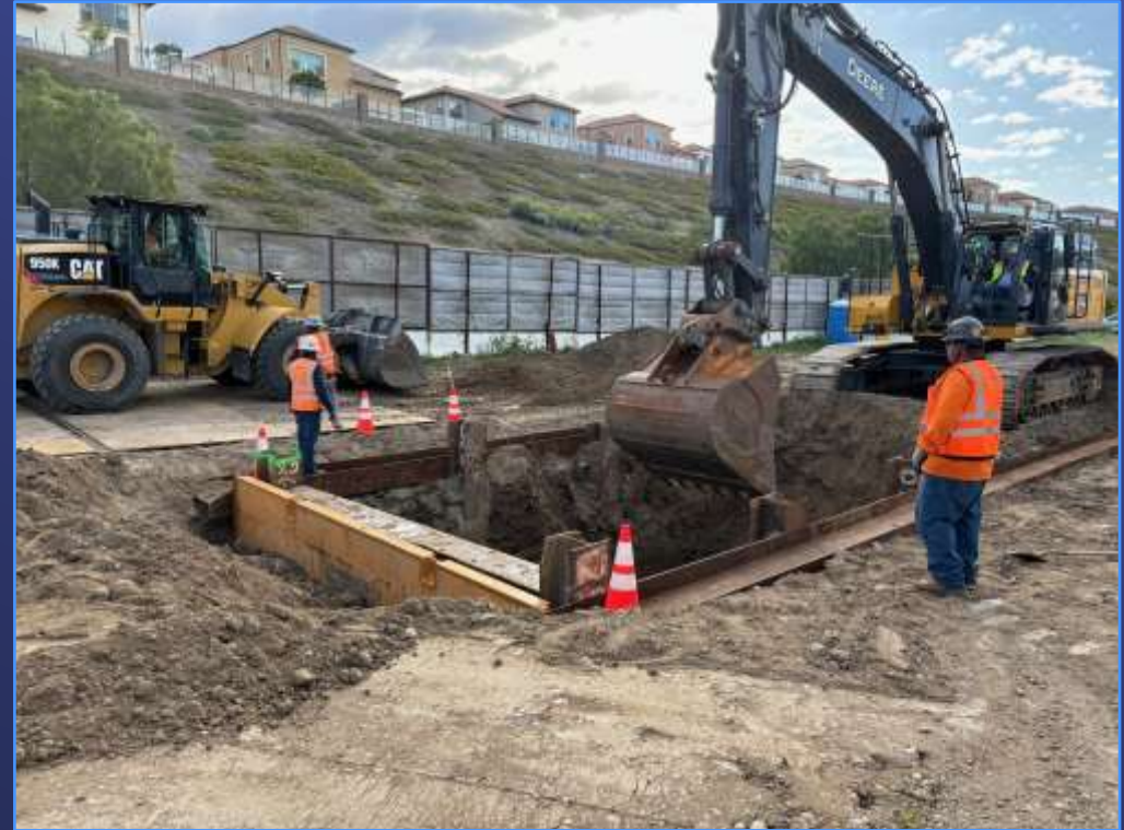
Access Site Excavation