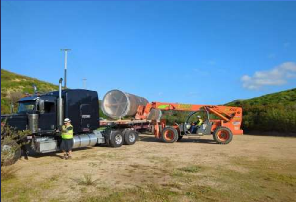
72-inch-diameter pipe delivery to project site