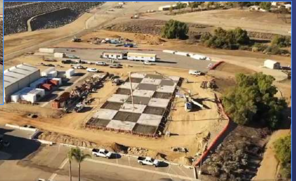
Checkerboard placement of concrete foundation slab