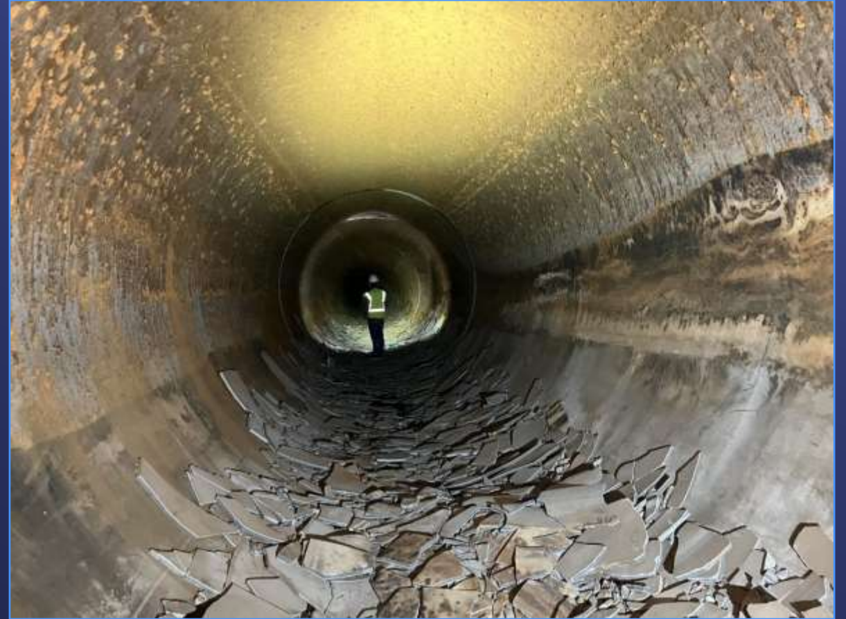
Removal of damaged cement mortar lining