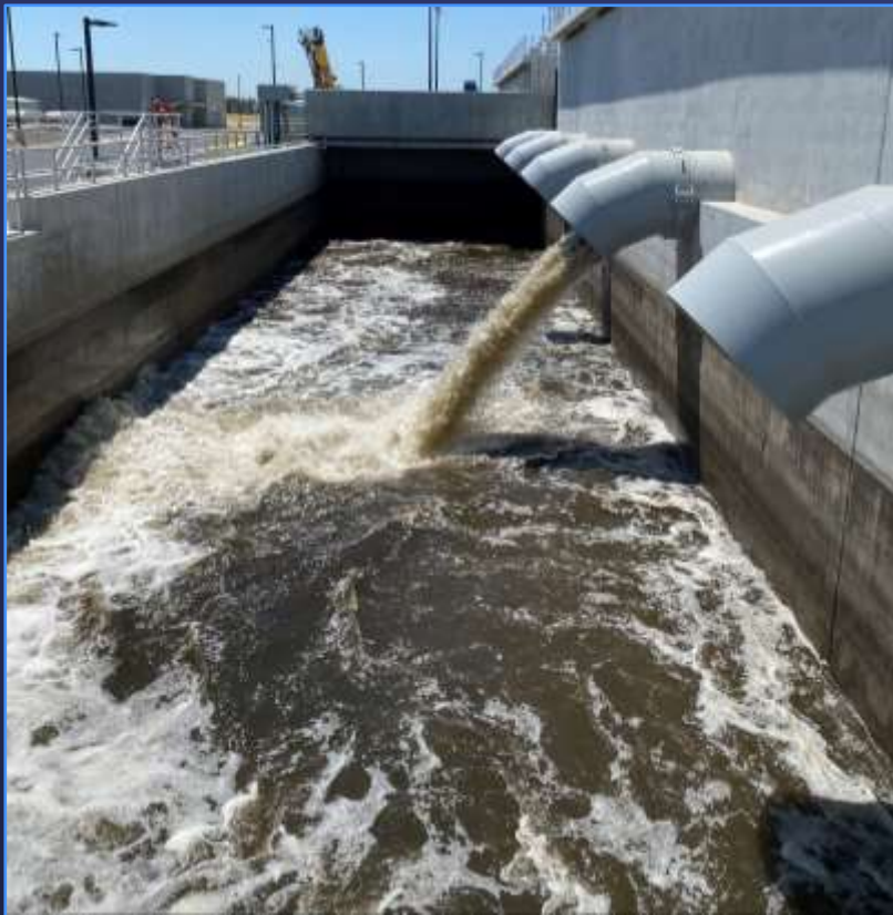
Backwashing Tertiary Filters