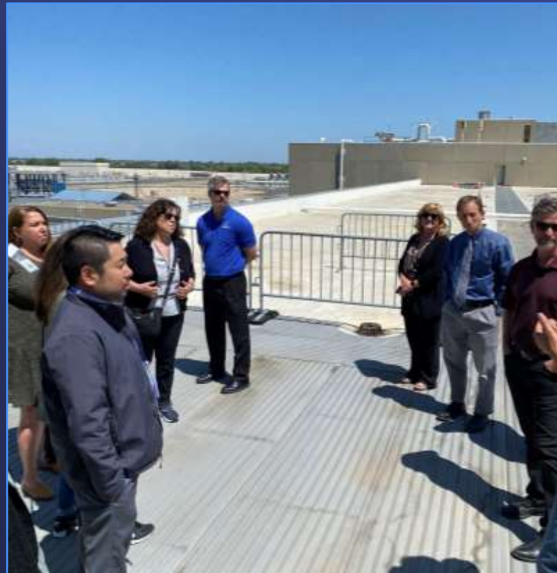
Discussing the Plant's $1.5B Modification Projects