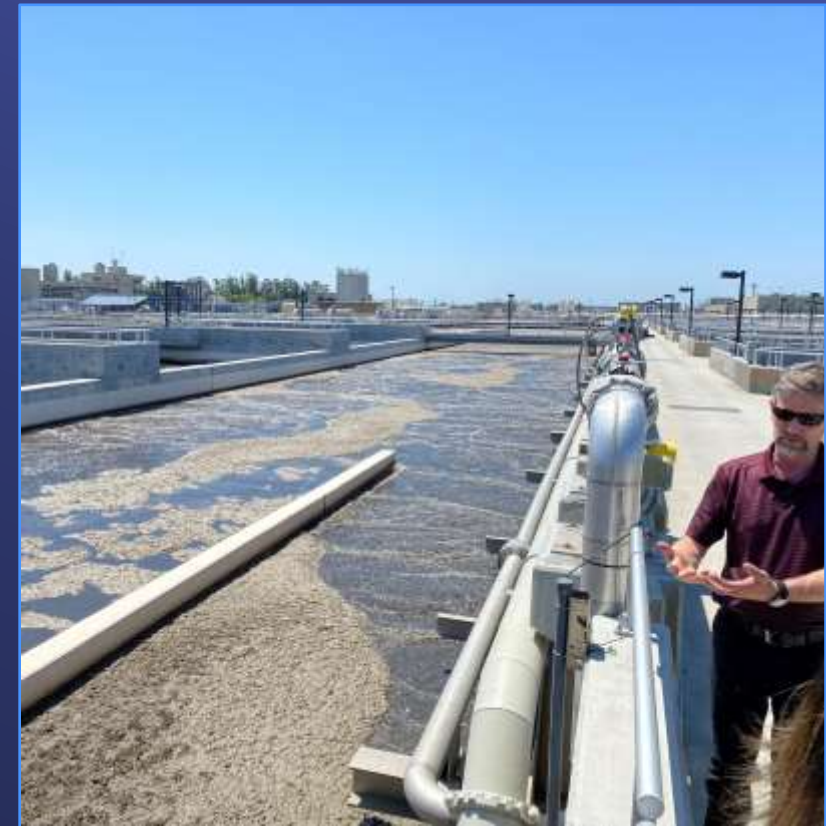
Enhanced Biological Process for Nitrogen Removal