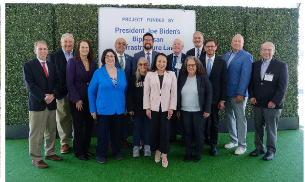
Officials gather for USBR's Announcement of Large Scale Water Recycling Project Grants