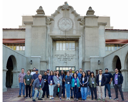
Employees leaving F.E. Weymouth Water Treatment Plant for a CRA Inspection Trip