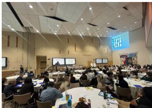
Del Amo Action Committee