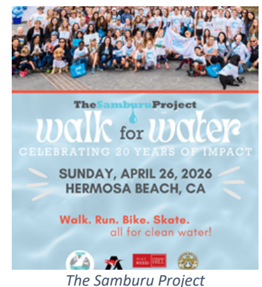
The Samburu Project