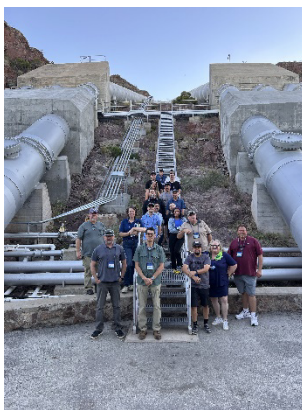
At the Colorado River Aqueduct Intake with inspection trip guests from the San Diego County Water Authority and Fullerton