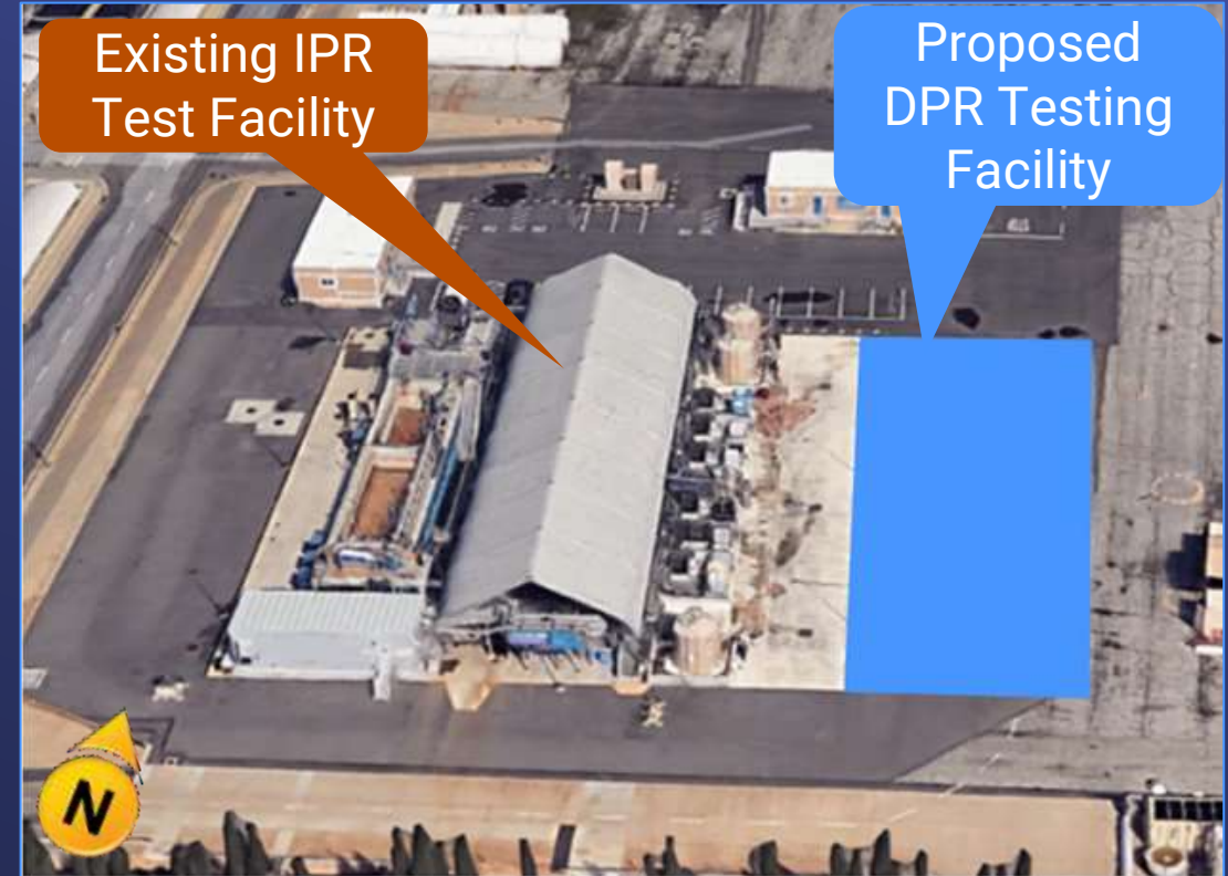
Grace F. Napolitano Pure Water Southern California Innovation Center