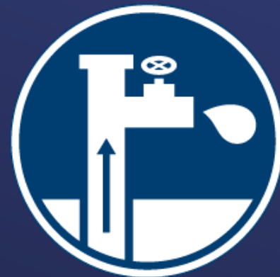
Groundwater Recovery (1991)