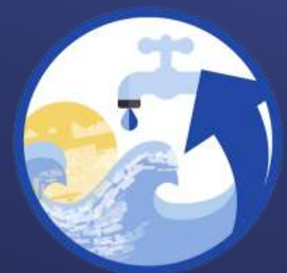
Seawater Desalination (2014)