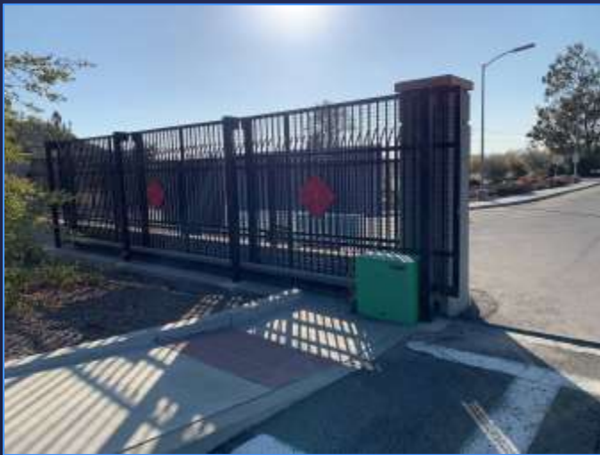
Crash-rated Gate (Example)