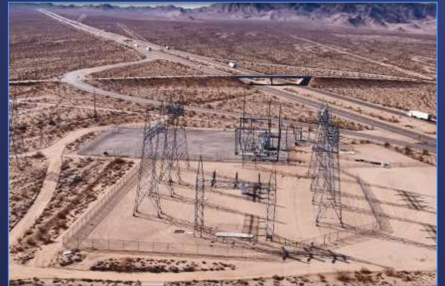
Camino Electrical Switching Station