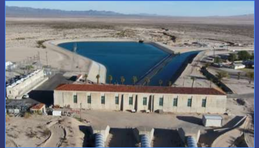
Iron Mountain Pumping Plant