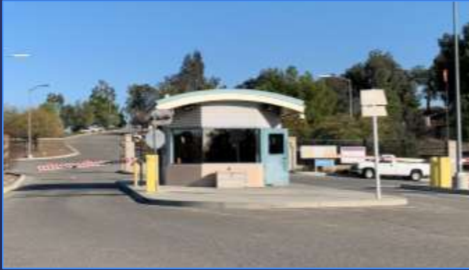
Guard Station (Example)