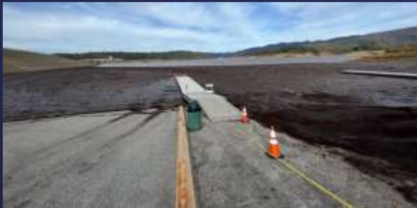
Castaic Lake Boat Ramp (Jan 12, 2023)