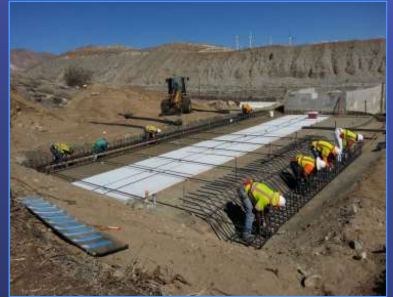
Typical Concrete Protective Slab