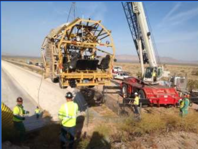
Tunnel Cleaning Machine