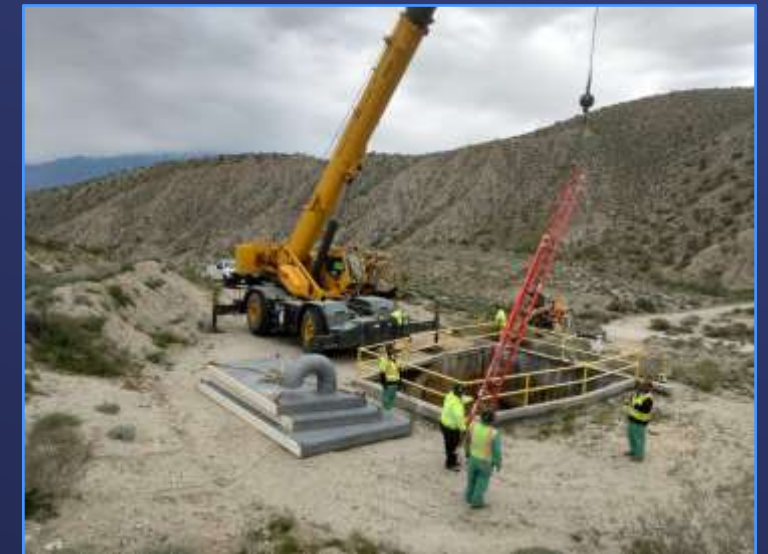
Transition Access Structure