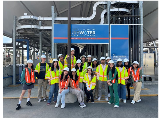
Cal State Long Beach students and professor touring the Pure Water Southern California facility