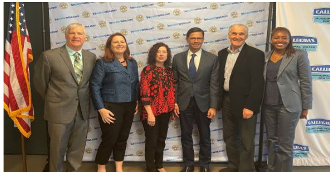
Metropolitan Community Leaders Briefing in partnership with Calleguas Municipal Water District.