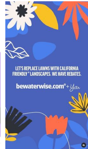
September social media posts