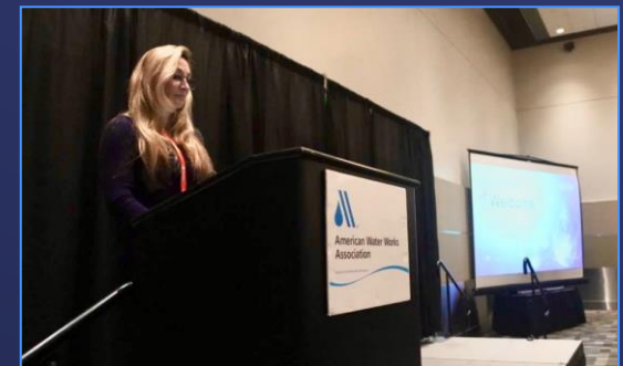
AWWA WQTC Conference