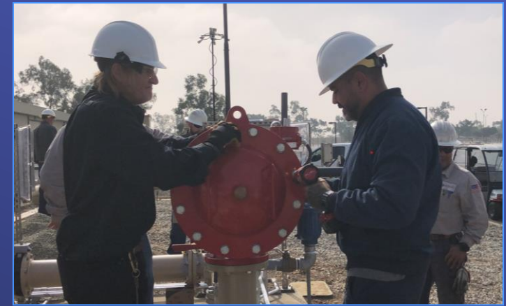
Installation of snail mitigation system