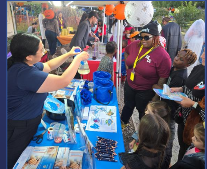
Strength-Based Communities for Change Water Harvest Festival