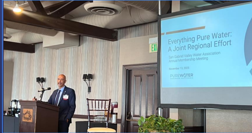
San Gabriel Valley Water Association Annual Membership Meeting