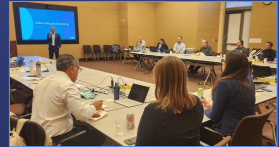
NWRI CalVal Workshop