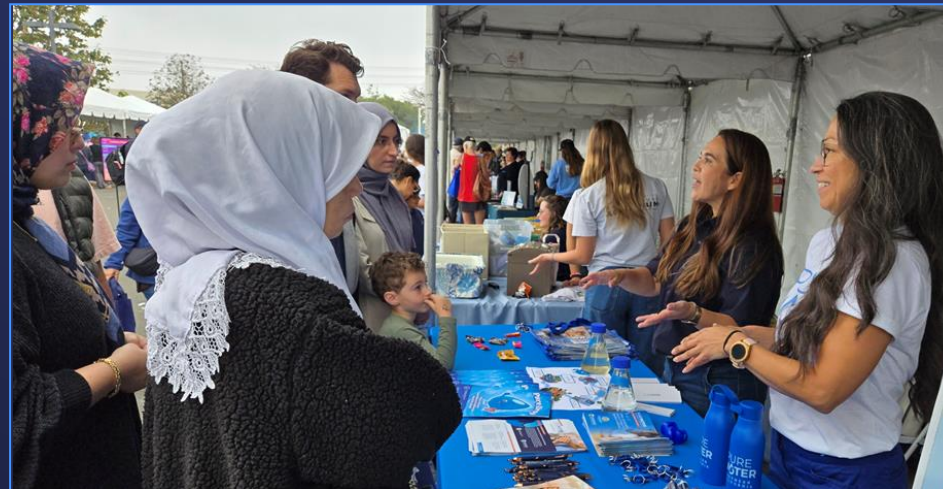
West Basin MWD's Annual Water Harvest Event