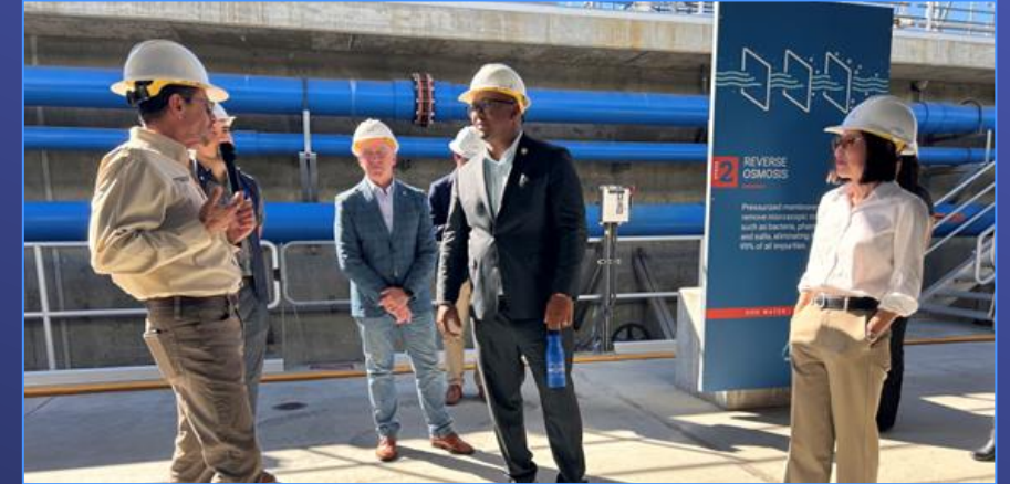
Tour with Long Beach Mayor Richardson