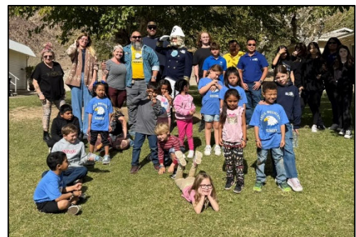
Education staff visited Eagle Mountain School, attended by many family members of Metropolitan employees and one of the smallest districts in California. They conducted a series of classroom activities and held a field trip. Desert staff hosted a luncheon for students.