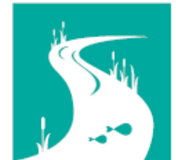
helped reduce pollution