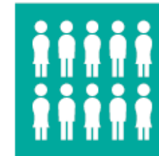
ensured that everyone in their community had basic water services