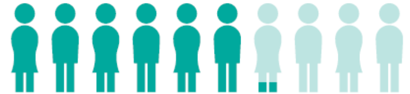
61% of voters would pay $50 more per year on their water bills if it:

Despite affordability concerns, 61 percent of voters would pay 50 dollars more per year on their water bills if it helped fund projects that prioritized the safety and health of their area's drinking water and ensured that everyone in their community had basic water and sewer service.