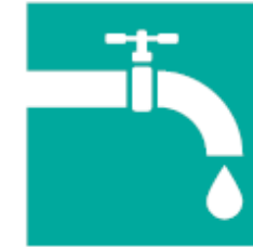
helped make drinking water safer and healthier