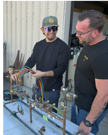
Cross-Connection Control Training

Class of 2026 Member Agency electrical apprentices completed their Basic Water Treatment course as part of the seventh-period curriculum. Completion qualifies them to apply for the California State Water Resources Control Board T2 or D2 certification exam.