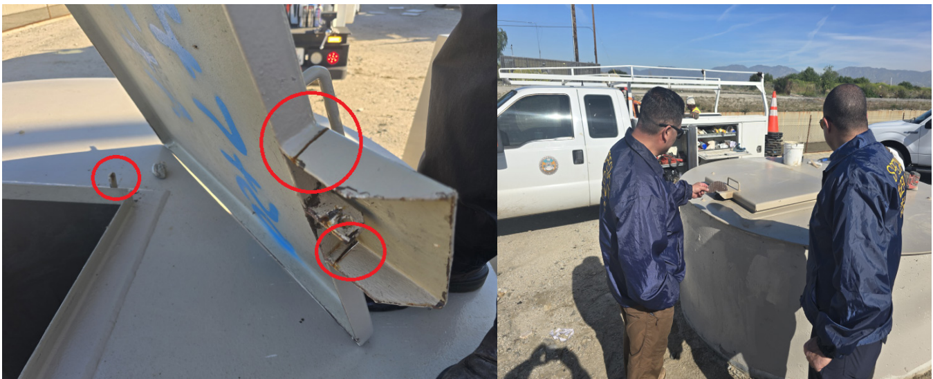
Metropolitan Security Specialists investigate breaches and break-ins at multiple substructures throughout LA County

Multiple Metropolitan substructures at Laurel Canyon Blowoff in San Fernando and Central Basin 52 were also recently vandalized in Los Angeles County by transient encampments seeking drinking water, power, and sheltering opportunities. Resources needed to respond, clean, repair, and refit these multiple substructure access points are costly, and intrusions like these could potentially cause service delivery interruptions, so it is vital that physical security devices be upgraded, reinforced, purchased, and repositioned to overcome mechanical theft attempts.