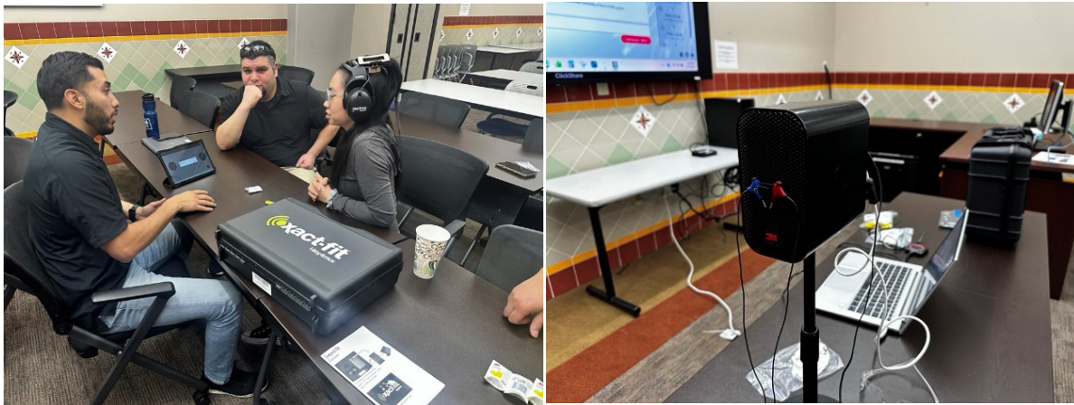
Hearing Protector Fit Testing Device Demos

Staff evaluated two hearing protector fit-test devices as options for proactively preventing hearing loss before incidents occur. When used as part of a health and safety program, the hearing protector fit-test device can ensure employees achieve adequate attenuation and properly fit their hearing protective devices.