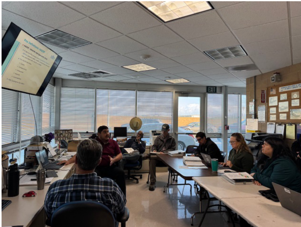
Process Hazard Analysis Revalidation Session

A 5-year Process Hazard Analysis Revalidation was completed for the Chemical Unloading Facility's regulated chlorine transloading operations.