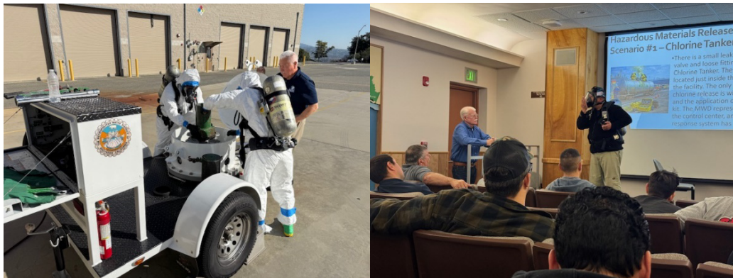
Chemical Responder and Incident Command Training at Diemer

The team updated and coordinated the annual training for the Chemical Response Program and Incident Command (IC), including the use of Self-Contained Breathing Apparatus, C-Kit for mitigating chlorine release, and a tabletop IC exercise at Diemer. This training teaches responders to recognize chemical hazards, perform notification and isolation, and use Personal Protective Equipment to respond effectively to limited spills and releases of known chemicals.