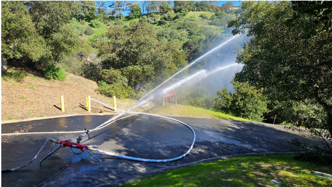
Demonstration of the high-pressure water system at Sepulveda PCS and Eagle Rock

Staff observed a demonstration of a wildfire preparedness tool at the Sepulveda Pressure Control Structure (PCS) and Eagle Rock facilities last month. The high-pressure water system can shoot water up to 100 yards around a critical site to decrease the chance of hot embers catching nearby hillsides on fire during a wildfire risk. Staff will continue to research these, and other devices, to determine the best products to meet Metropolitan's wildfire protection needs in the future.