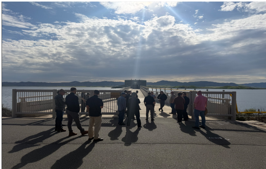
Metropolitan Security SAR Training with the FBI and Corona Police Department at Lake Mathews