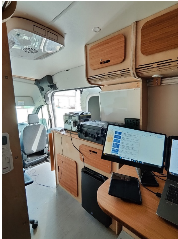
Interior View of Mobile Incident Command Van

Staff continued working on outfitting Metropolitan's new mobile command posts. Pictured below is the interior of the command van, which now has onboard Starlink satellite internet, Metropolitan Emergency Operations Center (EOC) radio, onboard power, AC/heater, fresh water, etc. The command trailer is also finalizing generator connections to power the unit long-term. The goal is to utilize these vehicles during the year to support major events, field training and exercises, and real-world emergency responses.