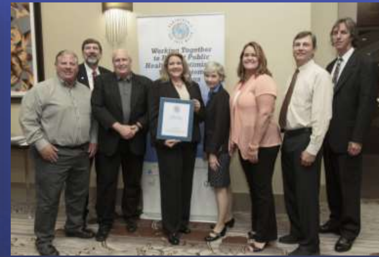
Partnership for Safe Water Awards