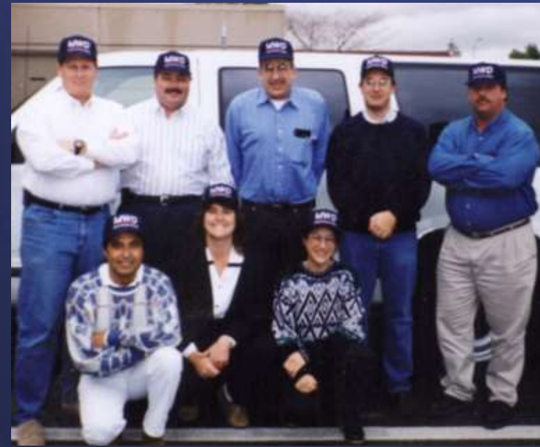
Water Quality Team (mid-1990s) Item #5A Slide 2