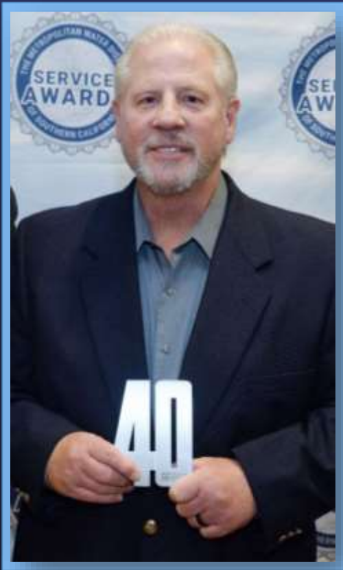
Mills Plant Manager March 11, 2025