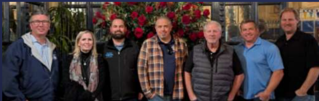
Mills Management Team Board of Directors