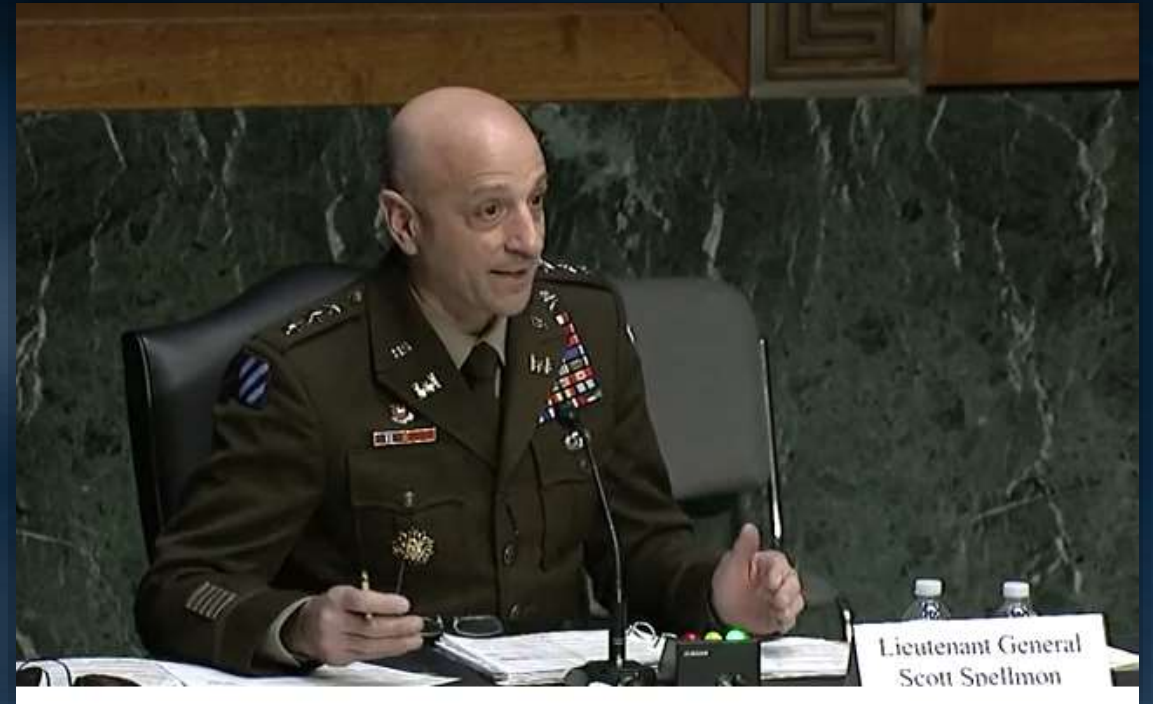
Lieutenant General Scott Spellmon Chief of Engineers and Commanding General United States Army Corps of Engineers