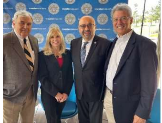
Community Leaders Briefing in Orange County

Metropolitan advocated in support of several bills in the state Legislature, including SB 903 (Skinner) focused on banning PFAS, AB 2409 (Papan) focused on infrastructure permitting transparency, AB 1827 (Papan) which clarifies Prop-218, and AB 2610 (Garcia), which will support conservation on the Colorado River.