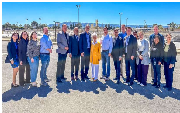
R - Congressional leaders and staff joined Metropolitan at the Grace F. Napolitano Pure Water Southern California Innovation Center; L- Representative Rouzer

Metropolitan hosted House Transportation & Infrastructure Subcommittee on Water Resources Chair Rouzer (NC-7) and Rep. Napolitano (CA-31), and staff to tour the Grace F. Napolitano Pure Water Southern California Innovation Center and learn more about the future of recycled water in Southern California. (April 2)