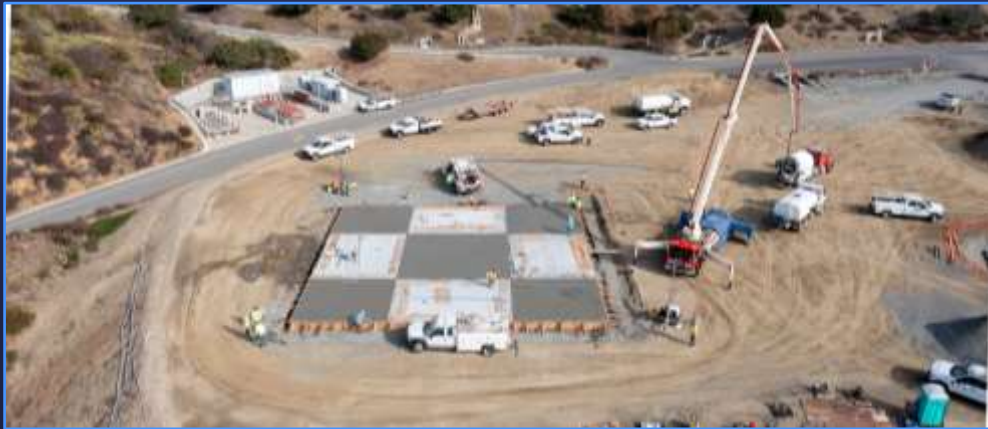
Aerial Photo of Site Work Including Concrete Placement of Helicopter Landing Pad