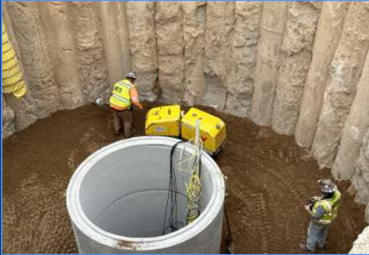
Compaction of Backfill in Southern Tunnel Shaft