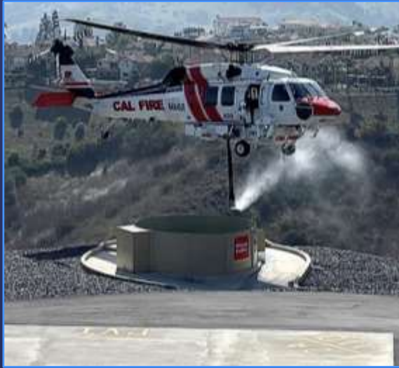
Demonstration of Helicopter Pulling Water from a Hydrant Facility