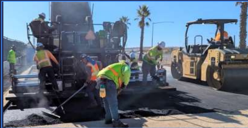
Paving Asphalt at Van Buren Blvd. City of Riverside