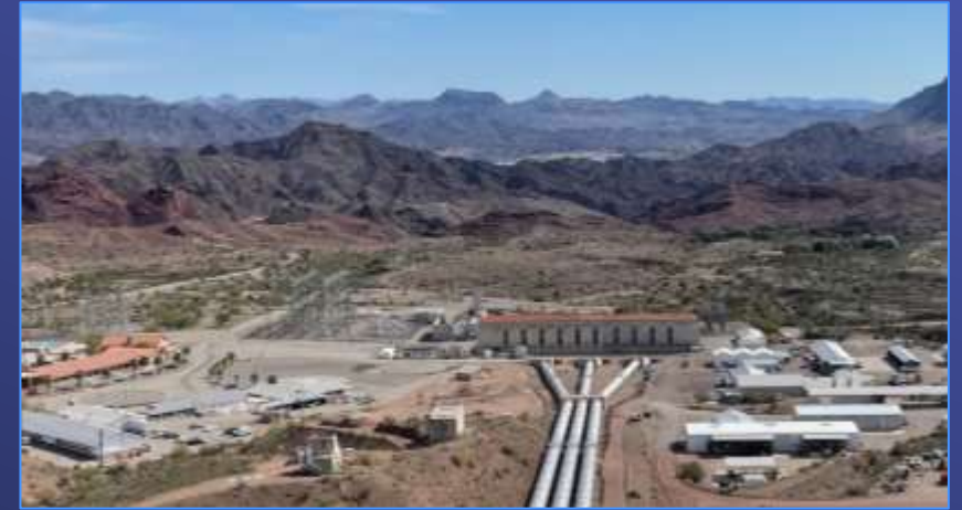
Gene Pumping Plant