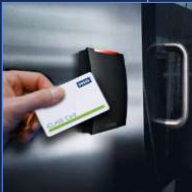
Access Card Reader