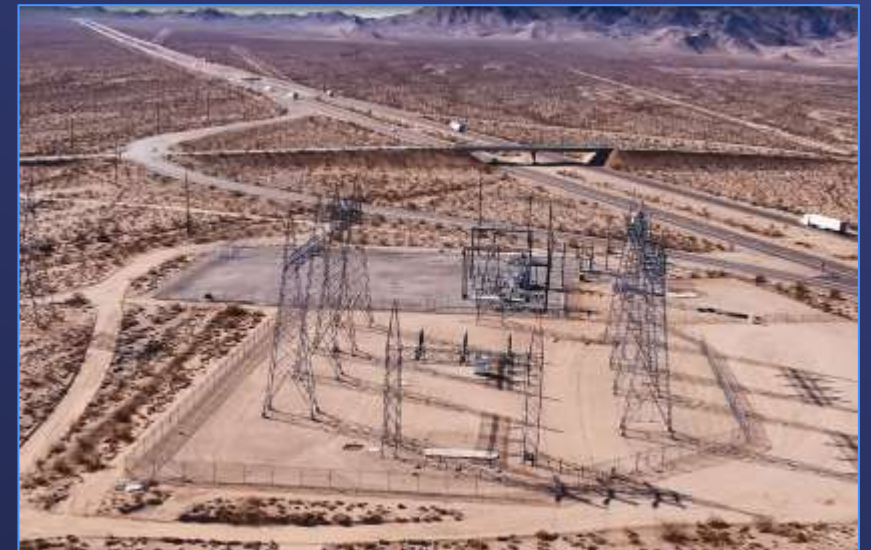
Camino Electrical Switching Station