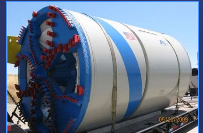
Tunnel Boring Machine