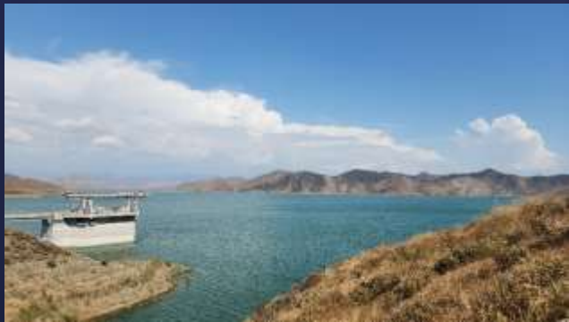
Diamond Valley Lake August 1, 2023