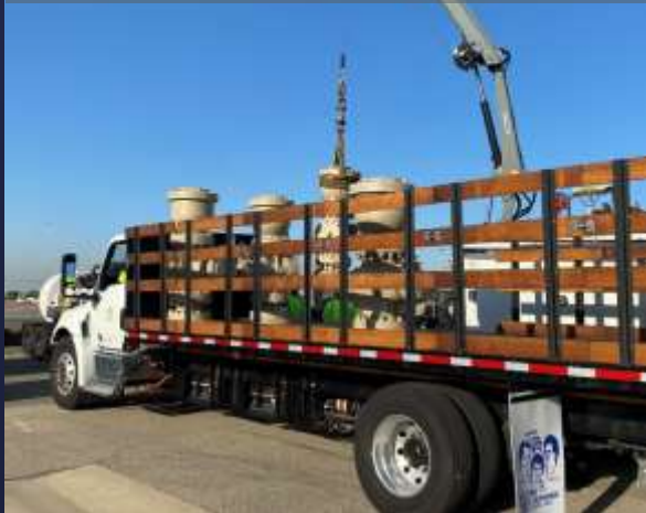
Testing electric flatbed truck during shutdown