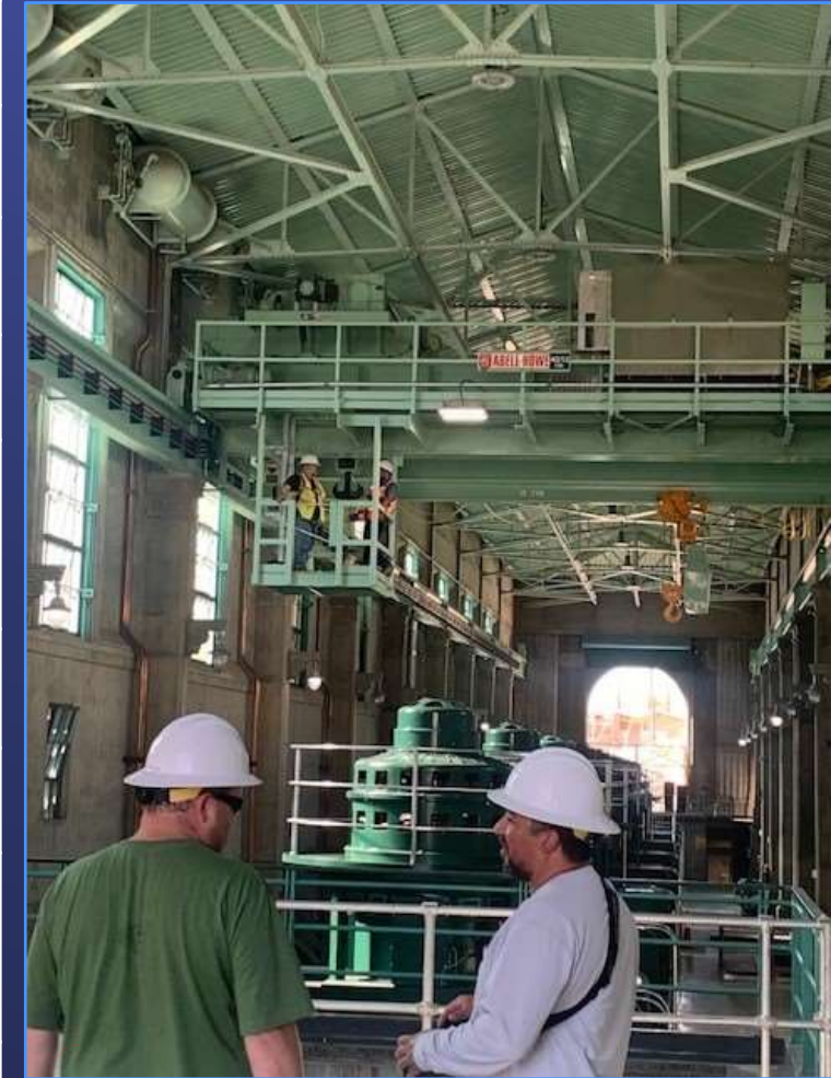
Iron Mtn. Pumping Plant

* Per Governmental Accounting Standards Board (GASB) provisions lead remediation is conducted with O&M funds